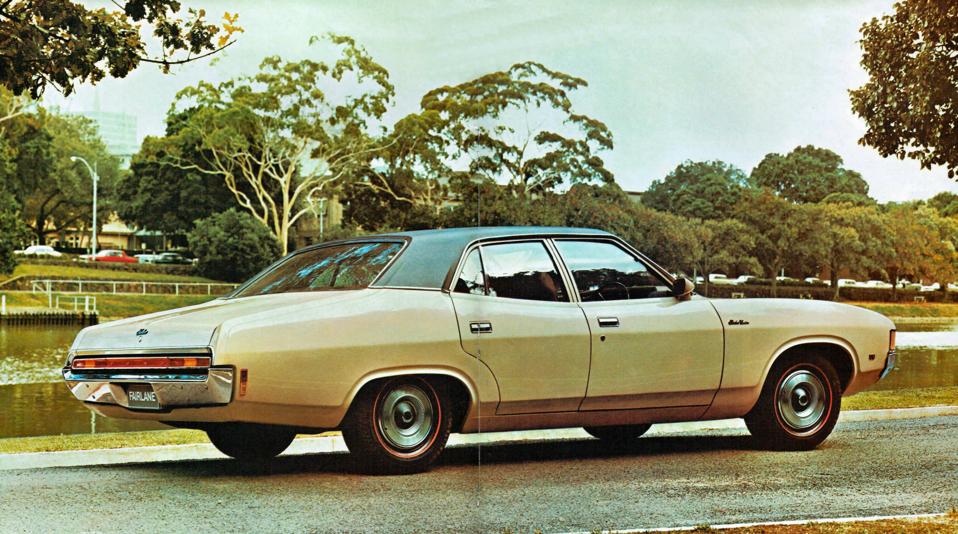
Fairlane Custom Sedan in Pottery Beige paint and with optional Vinyl roof, Full Wheel Covers and Red-wall Radial Tyres.