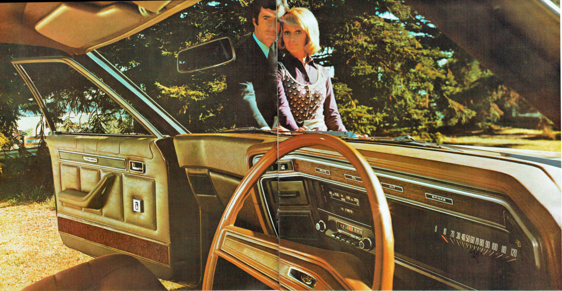
Fairlane 500 interior in Saddle Trim and with optional Radio and Power Windows.

New Fairlane. The quietest world on the road!