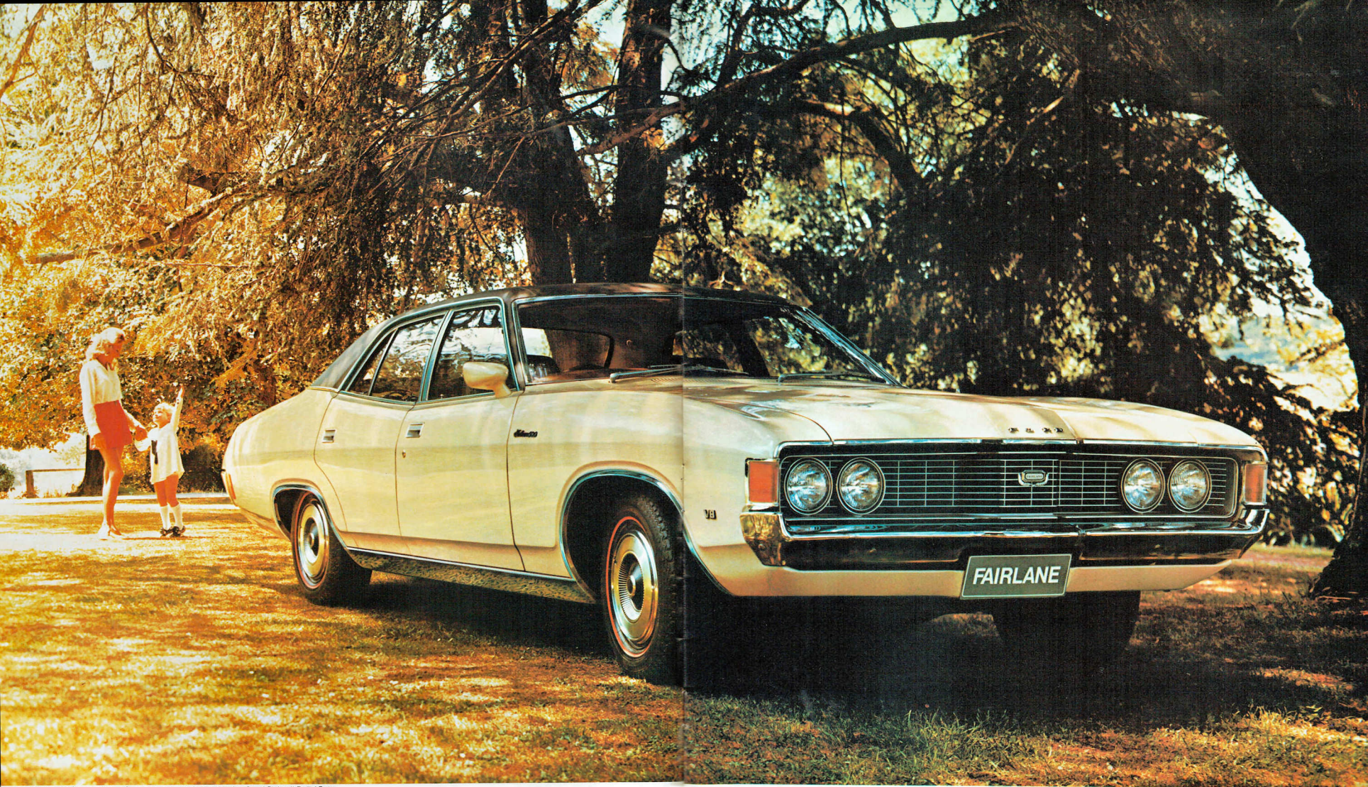
Fairlane 500 Sedan in Pottery Beige paint and with optional Vinyl roof, and Red-wall Radial Tyres.