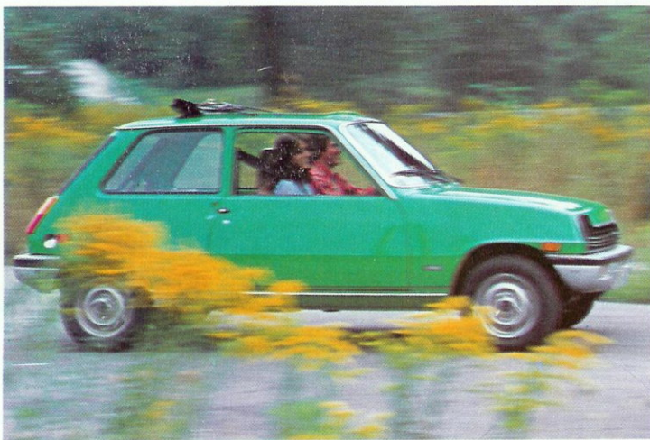
A Winner in the "fun-to-drive" Class

Breezing over the bumps, the Renault 5's comfort comes from the largest wheelbase of any car in its class. An important feature which means you don't feel the bumps because you're not sitting as close to the wheels.