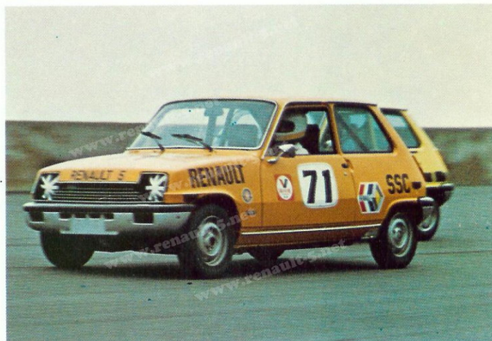
A Winner in the Showroom Stock Class

Now you can test the car the experts drive. It's rated tops in its class for handling, comfort and mileage.