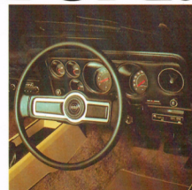
Illustrated. Left and Right Sundowner interior with optional push-button radio and cassette player available at extra cost.

Instrumentation's comprehensive all right! Includes tacho, oil and temperature gauges [REDACTED] What about the rubber? Big, wide ER70H radials to take the corners as they come. And when you do, you've got a ride that's more like a sedan than a van. Sundowner! You're cruisin'!