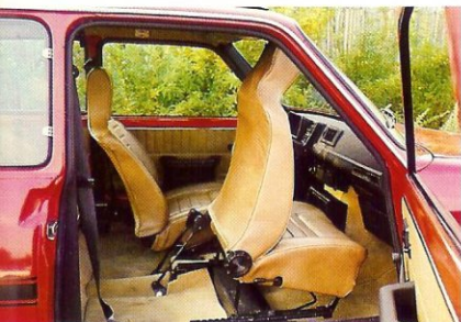
Front seat action assures easy access to rear . . . Reclining feature (GTL Deluxe) allows comfort.