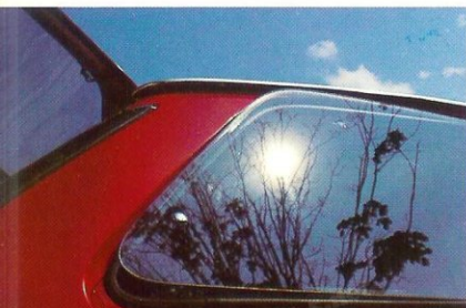
Swing-out window (GTL Deluxe) aids ventilation