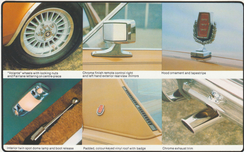
"Volante" wheels with locking nuts and Fairlane lettering on centre-piece