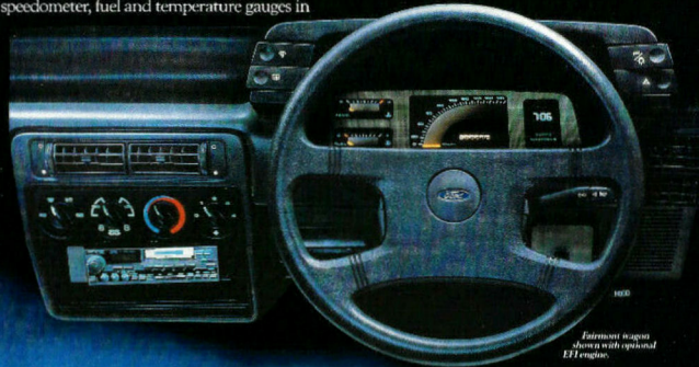
Fairmont wagon shown with optional EFI engine.

easy-to-read scales. A variable brightness digital clock featuring larger digits for clearer reading in daylight. More convenience is added in the binnacle which surrounds the instrument cluster where control switches are within a finger's stretch of the steering wheel.