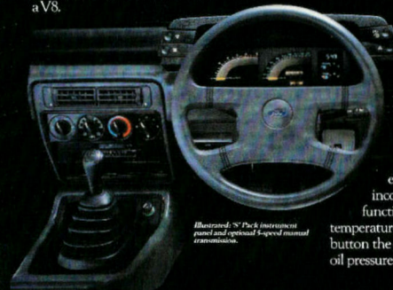
Illustrated: 'S' Pack instrument panel and optional 5-speed manual transmission.

Ford's electronic fuel injected engine gives you the power and torque reminiscent of a V8.