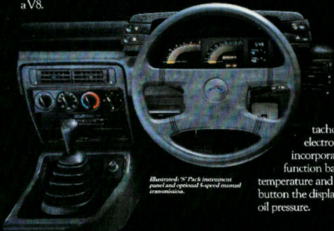
Illustrated: 'S' Pack instrument panel and optional 5-speed manual transmission.

Ford's electronic fuel injected engine gives you the power and torque reminiscent of a V8.