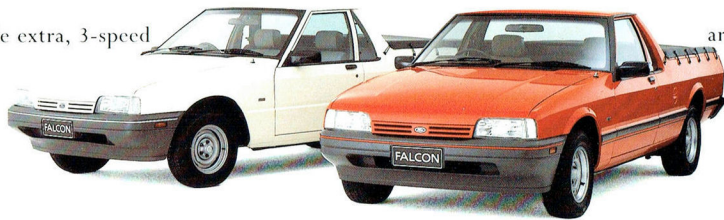
Ford Falcon Ute.

Ford's big 4.1 litre alloy head, 6-cylinder engine is standard in Falcon Utes and Vans. With the proven reliability of 3-speed manual or, for a little extra, 3-speed