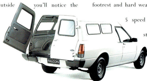
Ford Falcon Panel Van with twin rear doors.

Other standard GLS features include power steering, centre console with storage compartment, driver's footrest and hard wearing carpet on the floor. 5 speed manual transmission is standard.