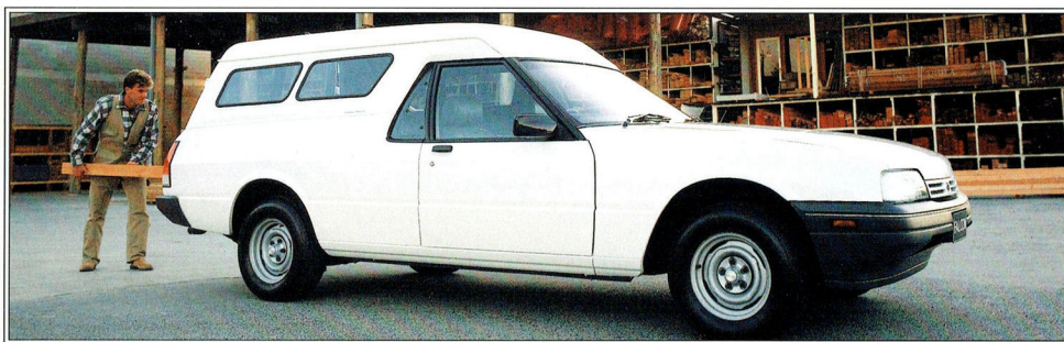
Falcon Panel Van. Big, secure load area.

reinforced floor panels. In the cab, you could almost forget that you're driving a vehicle principally designed for work. Falcon Utes and Vans are spacious and