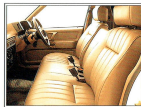
Large, durable bench seat. Comfortable bucket seats (Standard on GLS Ute.).

The GLS Ute has all the versatility of the standard ute, yet