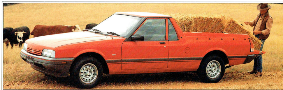
Ford Falcon GLS Ute. Big, versatile loadspace.