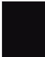
BLACK ONYX 202