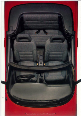
The sporty bucket seats in fashionable grey fabric.