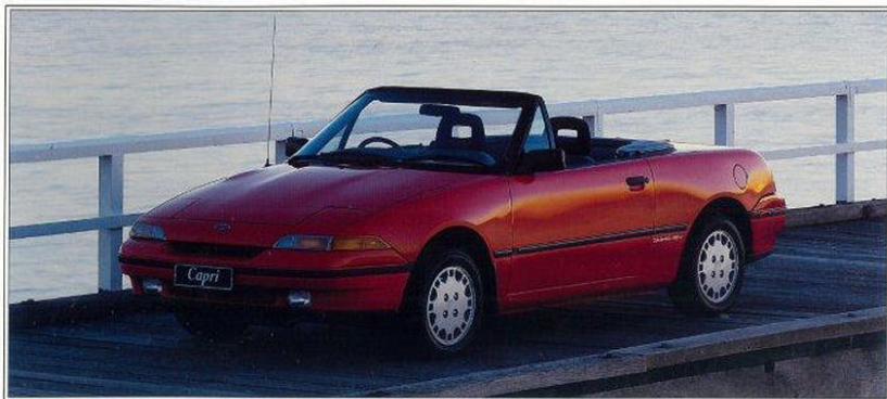
Ford Capri, alloy wheels and radial tyres are standard.

The Capri 1.6 litre, D.O.H.C., Electronic