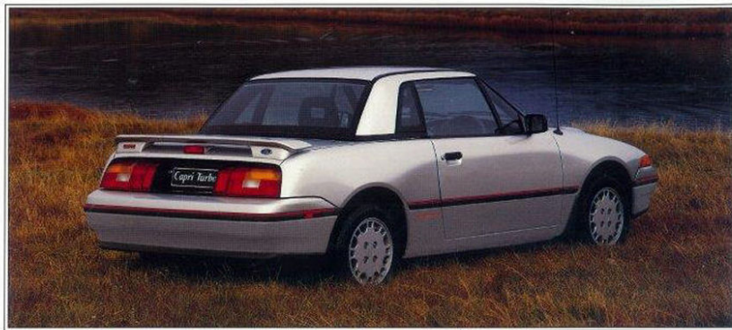
Capri hard-top, featured, is available as an option at extra cost.

So with everybody else in such a hurry to drive Capri, what are you waiting for?