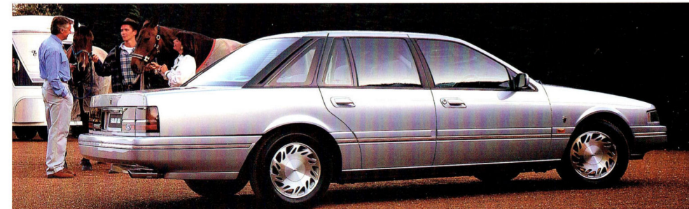
FAIRLANE GHIA Designed to carry you over any distance in exquisite luxury.

This brochure is designed to provide you with a general introduction to the Ford Products (including available optional equipment) referred to, and should be read in conjunction with the latest specification sheet. Because of changes in conditions and circumstances Ford reserves the right, subject to all applicable laws, at any time, at its discretion, and without notice, to discontinue or change the features, designs, materials, colours and other specifications and the prices of their products, and to either permanently or temporarily withdraw any such products from the market without incurring any liability to any prospective purchaser or purchaser. The latest specification sheet should be referred to for information on the availability, ordering and use of optional equipment. Always consult an Authorised Ford Dealer for the latest information with respect to features, specifications, prices, optional equipment and availability before deciding to place an order. *FORD MOTOR COMPANY OF AUSTRALIA LIMITED, (A.C.N. 004 116 223) Registered Office: 1735 Sydney Road, Campbellfield, Victoria 3061, Australia. Printed August 1994.