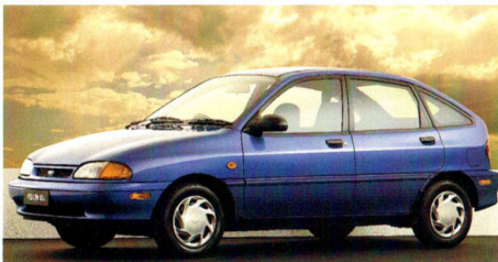
▶ FESTIVA GLI A powerful fuel injected engine. Outstanding road manners. The five-door Festiva GLI is the small car that's not afraid of the open road. Call it your escape hatch.