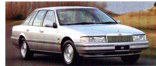
LTD Ford's most prestigious vehicle, representing the pinnacle of Australian luxury motoring.