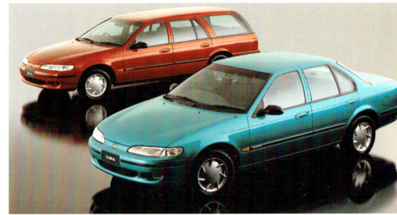
FALCON GLi SEDAN AND WAGON A Falcon GLi sedan or wagon, 4.0 litre six or 5.0 litre V8, is the outright choice for outright value for money.