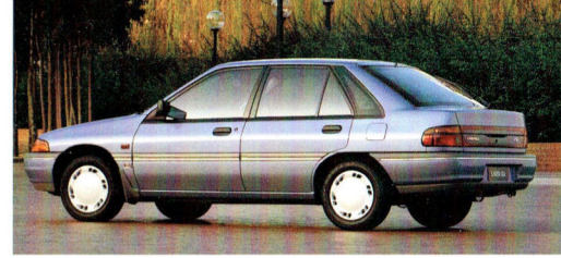
LASER GLi 1.8 litre 16 valve 5-door hatch.