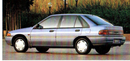
▶ LASER GLI 1.8 litre 16 valve 5-door hatch.

For a brilliant show of innovation, advanced engineering and value for money, take a trip through this brochure.