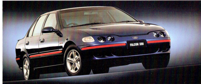
FALCON XR8 The V8 version of the superb sporting Falcons jointly produced by Ford and Tickford Vehicle Engineering.