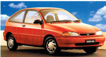
▶ FESTIVA TRIO With its powerful 1.3 litre EFI engine, the 3-door Festiva Trio is fun to drive and easy on the wallet.