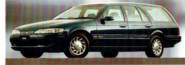
FALCON FUTURA WAGON Falcon Futura wagon is the perfect touring and carrying machine with 'Best in Class' load space.