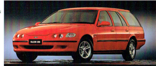
▶ XR6 SPORTS WAGON Who said wagon buyers can't have fun? This is the one that breaks away from the wagon stereotype and delivers sports handling and performance along with a wagon's practical attributes.