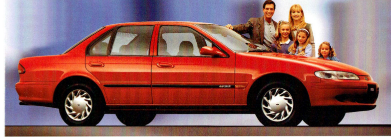
FALCON FUTURA SEDAN Ford Falcon Futura occupies the high ground in technology, performance and refinement.