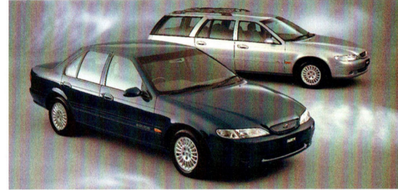
FAIRMONT SEDAN AND WAGON Never before has so much pleasure for the driver been combined with such luxury for the passengers.