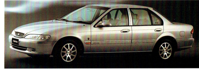
FAIRMONT GHIA An executive package with all the fringe benefits. Fairmont Ghia admits you to a world of luxurious appointments, rich leather and abundant room.