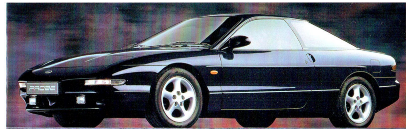
▶ PROBE A 2.5 litre V6 engine, with 24 valves and electronic fuel injection. Anti-lock brakes and a ground-bugging stance. Ford Probe. A beautiful body. And a passionate soul.