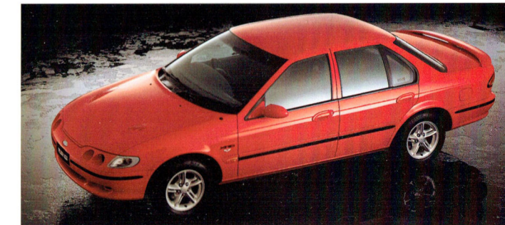
FALCON XR6 Ford and Tickford jointly bring you true sporting cars that stand apart from all others for their performance and refinement.