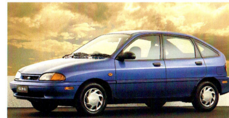
FESTIVA GLi A powerful fuel injected engine. Outstanding road manners. The five-door Festiva GLi is the small car that's not afraid of the open road. Call it your escape hatch.