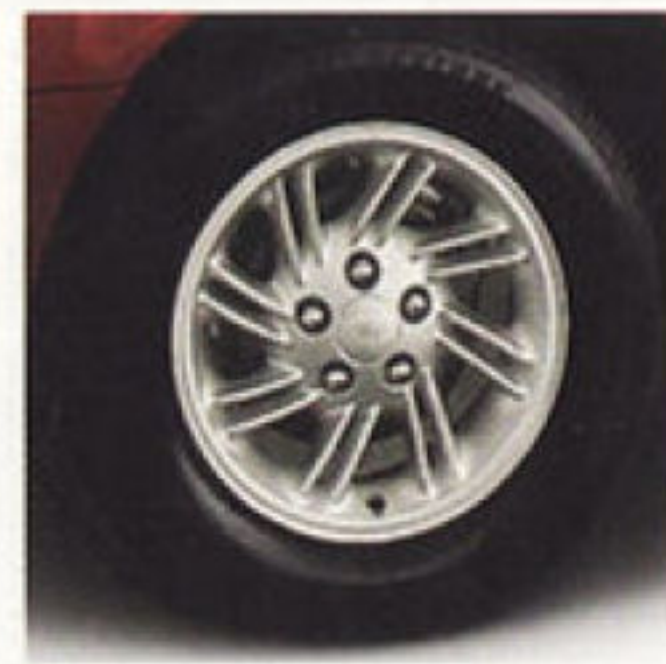
Alloy wheels and P205-R15 tyres.

It's all part of Falcon's program of continuous improvement.