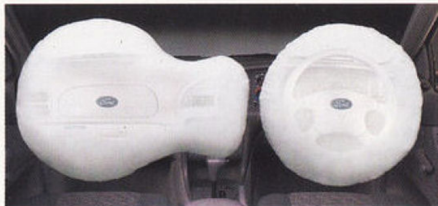
Passenger airbag optional on GLi and Futura Olympic Classic.

And of course, your Olympic Classic will be fully equipped with the built-in 'extras' that help make Falcon our top selling car.