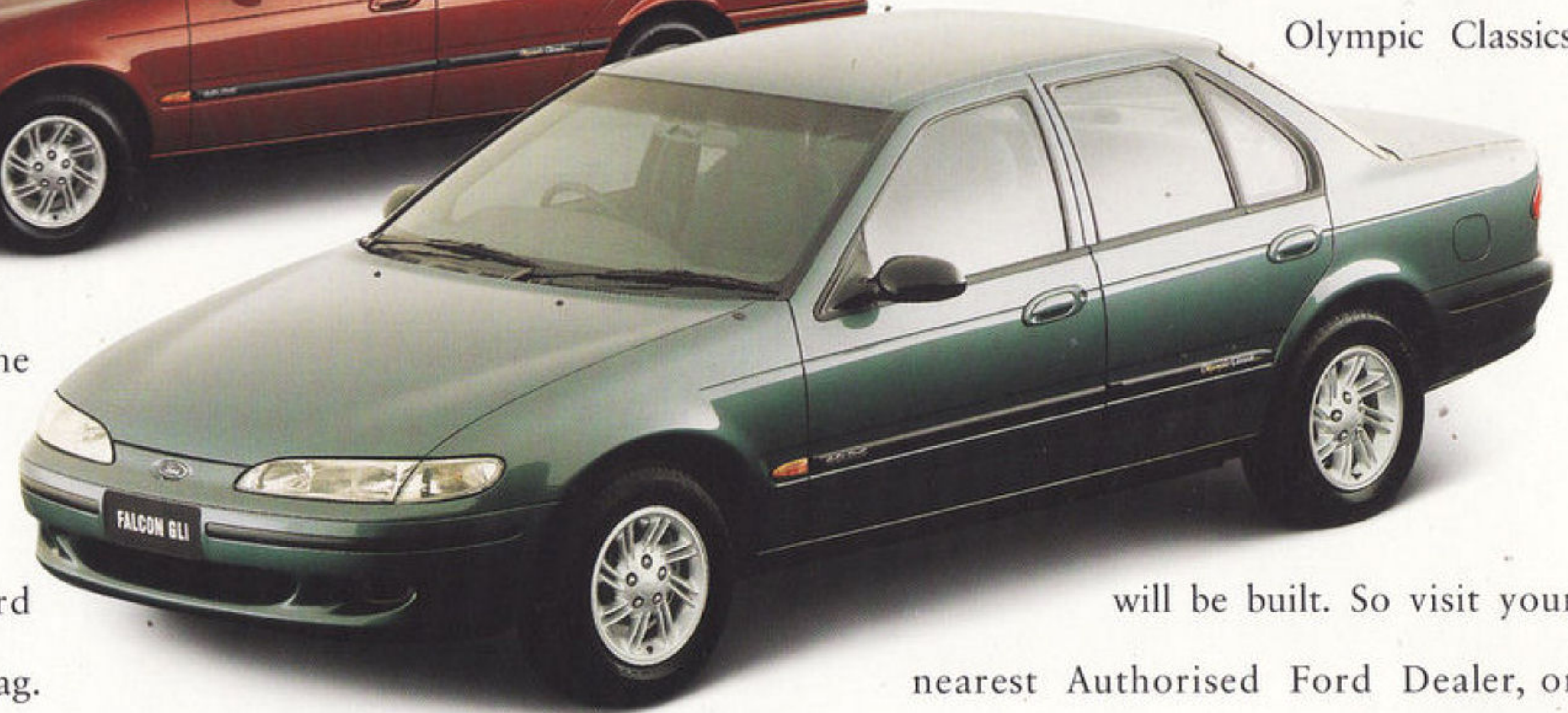
Olympic Classic GLi sedan and GLi wagon.

And in the Futura Olympic Classic, a six speaker AM/FM stereo system will make the ride even more of a pleasure.