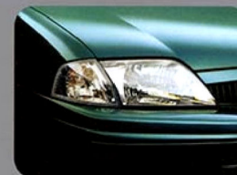
A newly developed, high-gloss paint improves stone-chip resistance and protects Laser's beauty. Somewhat of a green machine, Laser cares for the environment too. Over 85% of materials used have been designed for future recycling.