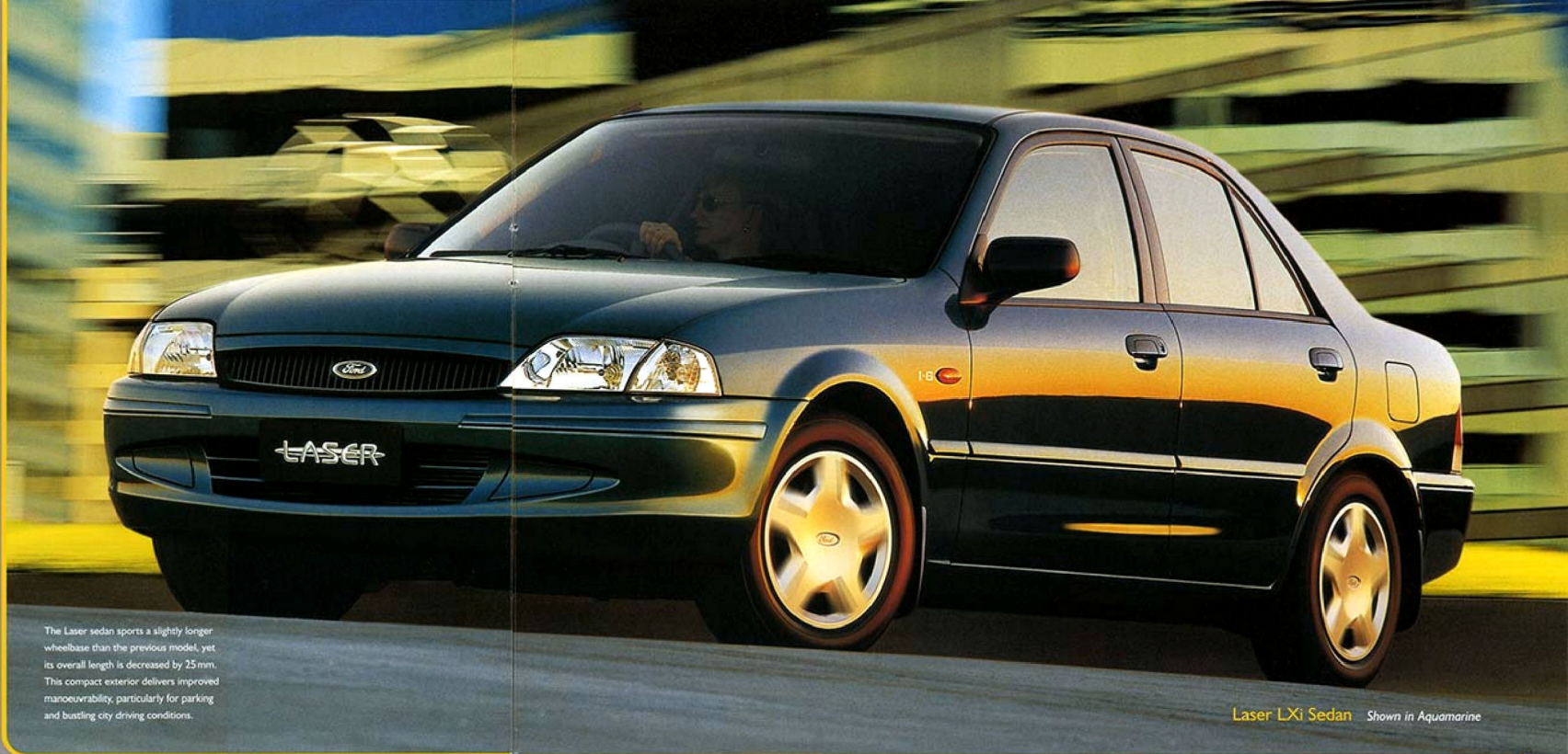
The Laser sedan sports a slightly longer wheelbase than the previous model, yet its overall length is decreased by 25mm. This compact exterior delivers improved manoeuvrability, particularly for parking and bustling city driving conditions.