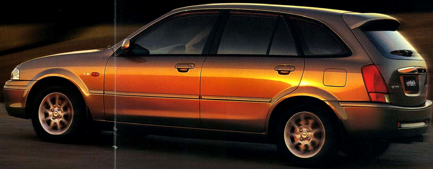
Laser GLXi Hatch Shown in Gold Dust with optional equipment