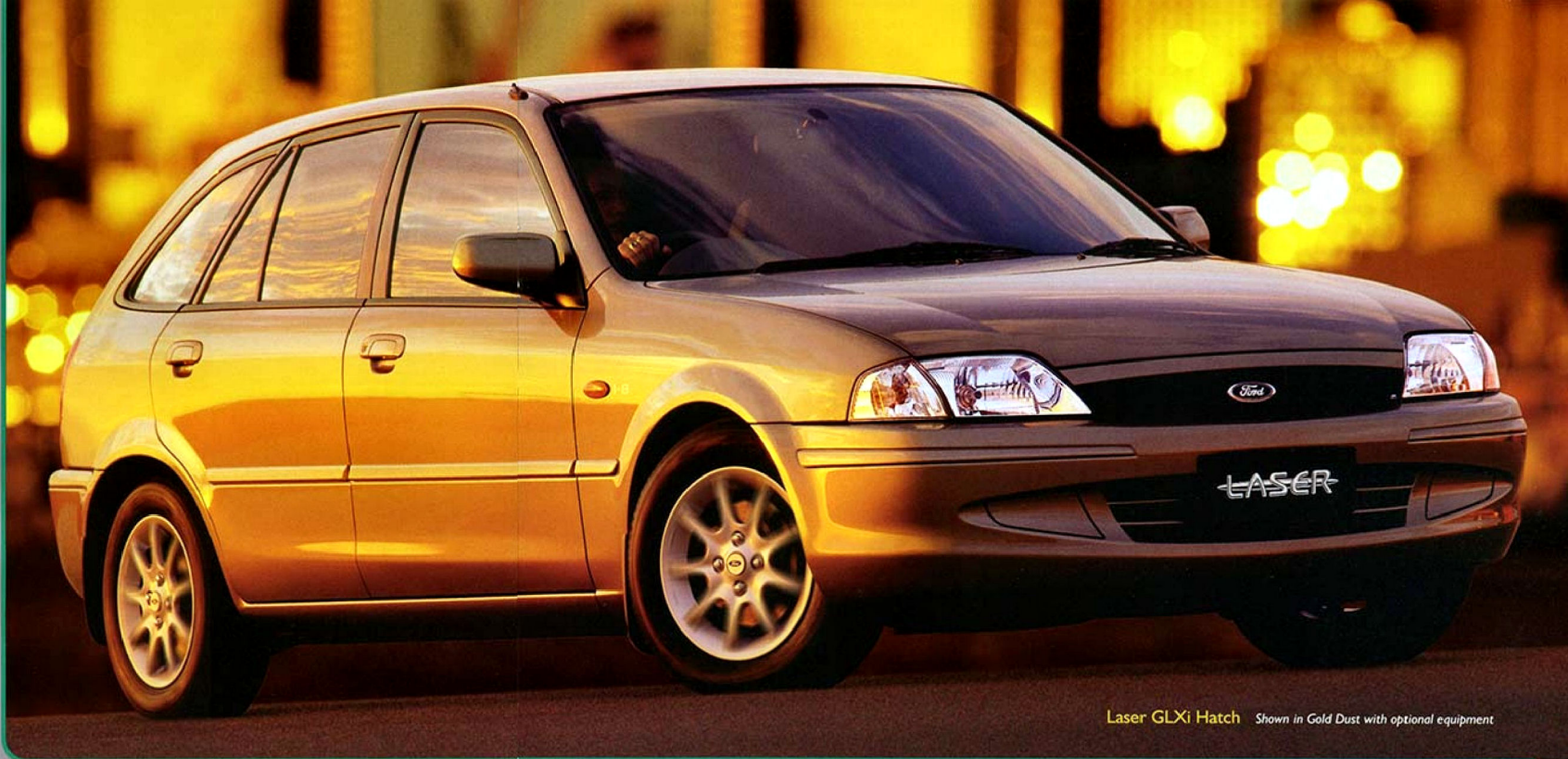
Laser GLXi Hatch Shown in Gold Dust with optional equipment

Laser has always delivered excellent steering, ride and handling. For our engineers the challenge was to better this reputation. Sophisticated front and rear suspension designs focus on reducing weight wherever possible. They offer the ultimate balance of driving comfort. Whether it's at highway speed, in crosswinds or negotiating tight corners, you'll enjoy Laser's precise handling.