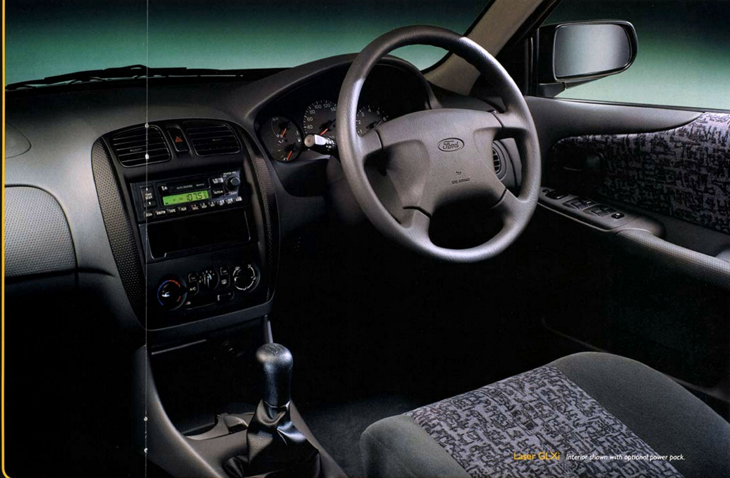
Laser GLXi Interior shown with optional power pack.

Laser's new climate control system incorporates a clean-air system with an anti-bacterial air conditioning and pollen filter. Just turn the dials and feel the difference.