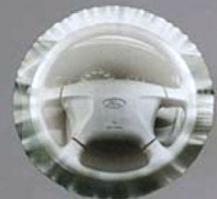
Laser takes preventative measures seriously. A driver's side airbag is standard on all models.

Refinements like improved suspension and responsive steering maximise control. While to keep your Laser safe and sound, an engine immobiliser serves as a deterrent to unwanted admirers. If anyone attempts to use any other key except the supplied electromagnetic one, the immobiliser disables both the fuel and ignition system.