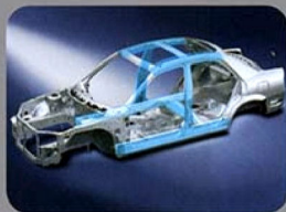
The triple 'H' roof, bodysides and floor reinforcements increase Laser's rigidity. Vehicle dynamics, steering and handling are also improved. The result for you is a quieter, more comfortable and more responsive drive.