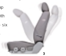
1. Power-tilt Headrests 2. 60:40 Split Rear Seat (5-door) 3. 8-way Adjustable Driver's Seat

Rio has got room to handle your active life. The completely redesigned interior offers ample headroom and legroom for five passengers and cargo space for oversize gear. The spacious feeling inside is enhanced by contemporary shapes and textures, and a large glass area. Standard amenities include a rear window defroster, a 12-volt power outlet, assist grips, door storage bins and map pockets. Rio also comes audio system-ready with four standard speakers (upgradeable to six speakers with A-pillar tweeters), and 4 and 5-door interiors specifically tuned for optimum sound quality.