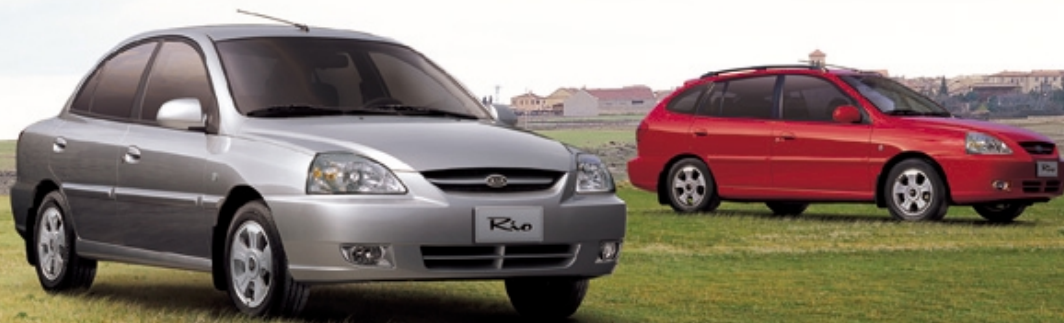
4 - Door : RS/LS & 5 - Door : RS/LS (Roof rack: optional)