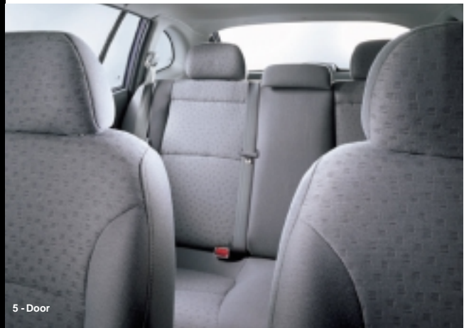
4 - Door 5 - Door