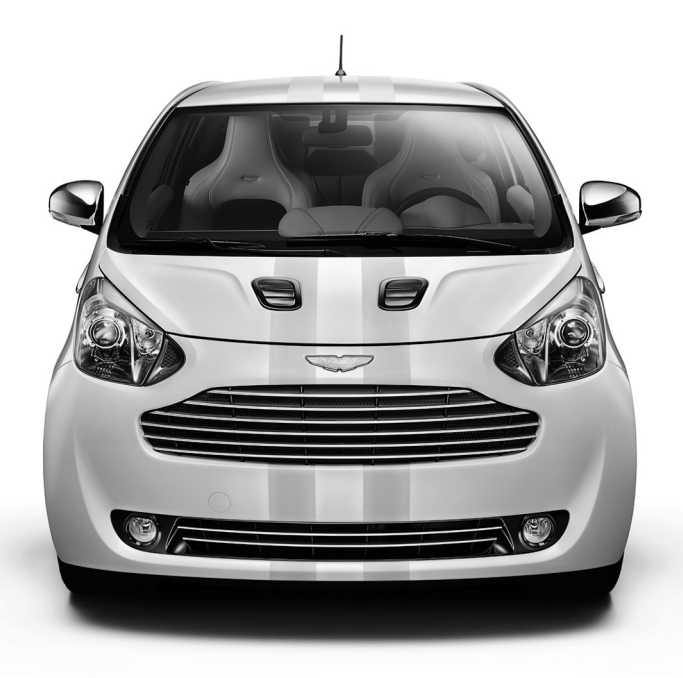
Snow\ White\ metallic\ paint\ |\ Twin\ matt\ body\ stripes\ |\ Silver\ meshes\ |\ Chrome\ brightwork\ |\ White\ Diamond\ turned\ alloy\ wheels