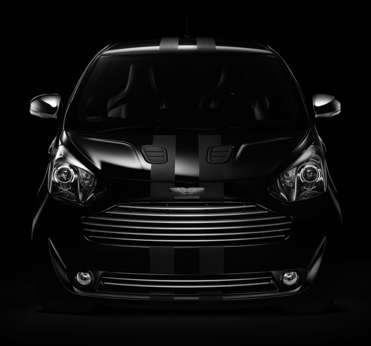
Magic \ Black \ metallic \ paint \ | \ Twin \ matt \ body \ stripes \ | \ Black \ meshes \ | \ Chrome \ brightwork \ Black \ Diamond \ Turned \ alloy \ wheels