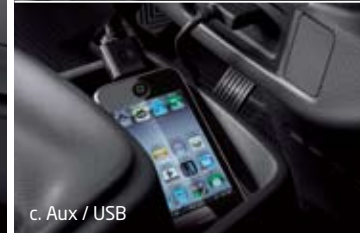
c. Aux / USB