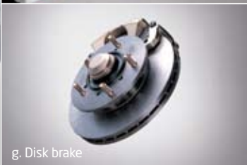
g. Disk brake