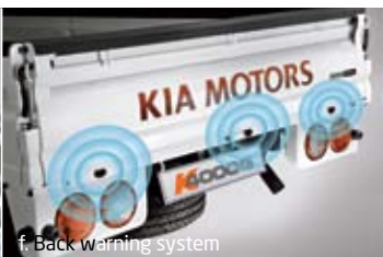
f. Back warning system