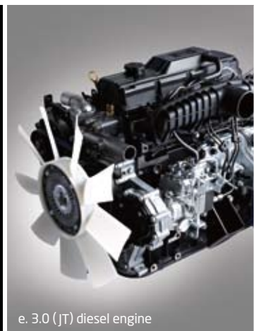
e. 3.0 (JT) diesel engine