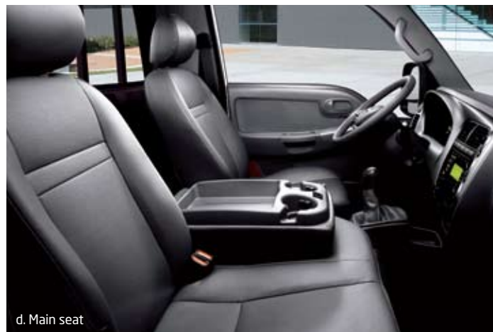
d. Main seat

a. The metallic tone centre fascia creates a distinctive high-tech image, while the climate control system integrates the heating, air conditioning and ventilation controls into one unit. b. The versatile glove box offers convenient storage solutions for small items while providing up to 11.13 litres of total space. c. A conveniently located Aux/USB socket allows you to play your favorite tunes from just about any external music device. d. Spacious seats are tastefully finished artificial leather or cloth while the centre seatback can be folded forward to reveal a double layer tray with two cup holders, memo clip and coin tray. e. The driver seat features adjustable lumbar support at the touch of a button to provide maximum comfort on long journeys. f. Makes maneuvering the K-series truck a breeze while also allowing you to set your preferred steering wheel height position for maximum comfort. g. Fills the riding space with premium sound while offering maximum connectivity to external music devices.