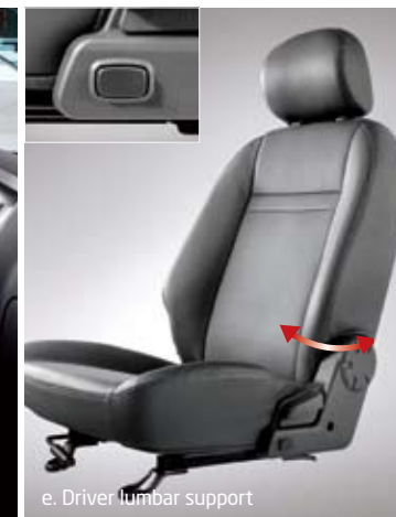
e. Driver lumbar support