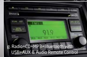
g. Radio+CD+MP3+Bluetooth with USB+AUX & Audio Remote Control