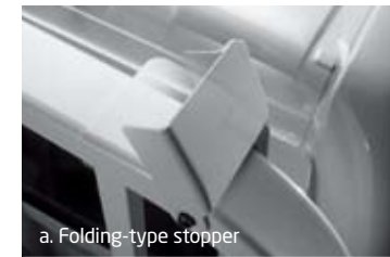
a. Folding-type stopper