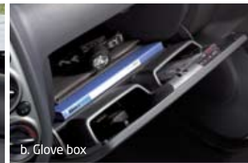
b. Glove box