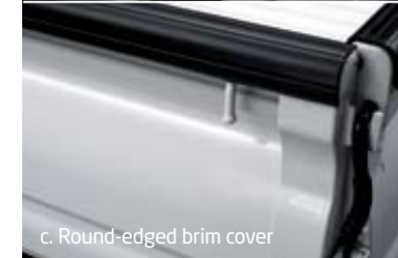
c. Round-edged brim cover