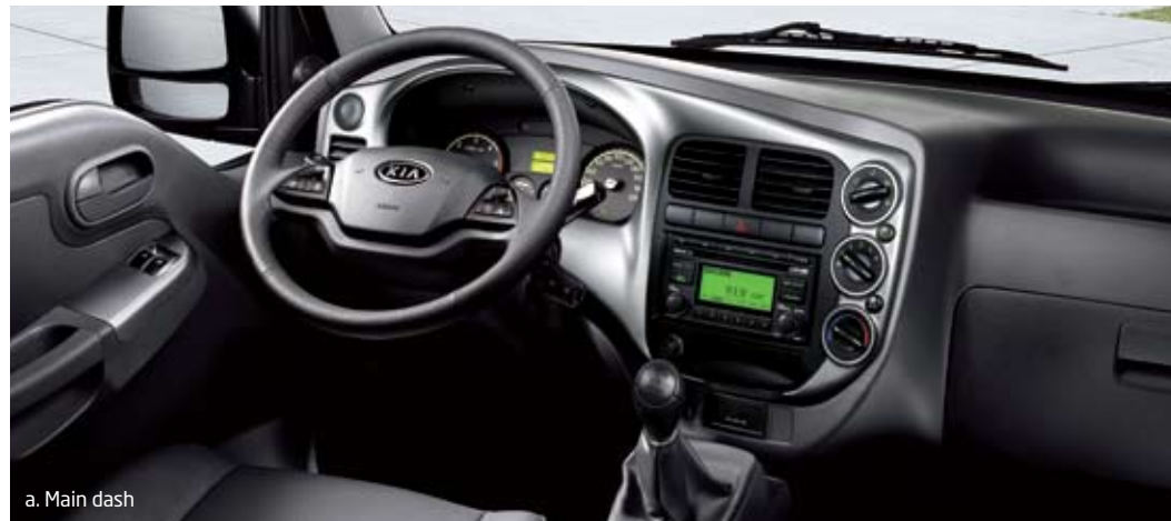
a. Main dash