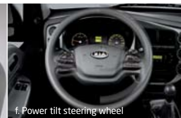
f. Power tilt steering wheel