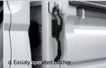
d. Easily operated catcher