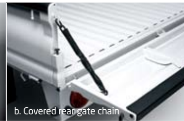
b. Covered rear gate chain