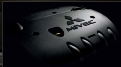
Fuel-Efficient MIVEC Engines