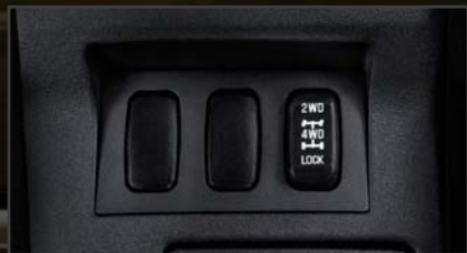
Available All-Wheel Control