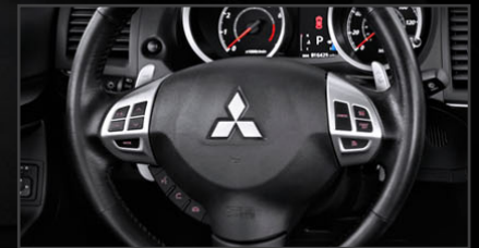
FUSE Hands-Free Link System™