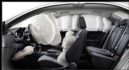
Seven Standard Airbags 3

Sure, the 2012 Lancer's seven standard airbags 3 helped make it a 2012 IIHS Top Safety Pick for five years running. But with innovative features like available keyless entry and hands-free controls for your phone and MP3 player, it's easy to forget you've made a rather responsible decision.