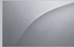
3D_Bright Silver (Metallic)