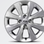
15-inch Alloy Wheel