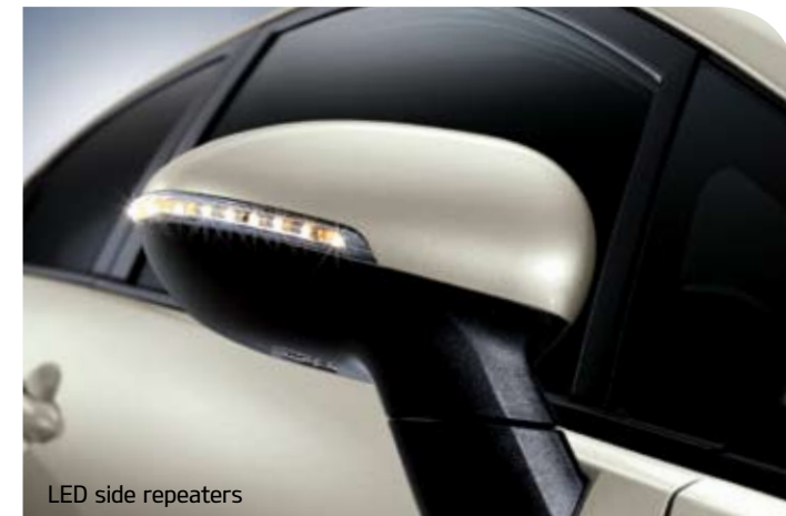
LED side repeaters

Emanating flair from every angle, the Rio's low, wide stance and short overhangs give it a strong, youthful identity all of its own.