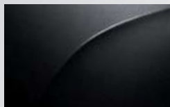
ABP_Aurora Black (Pearl)