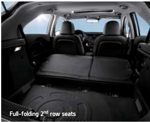
Full-folding 2 nd row seats