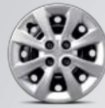
14-inch Steel Wheel