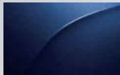
BLA_Formal Deep Blue (Pearl Metallic)