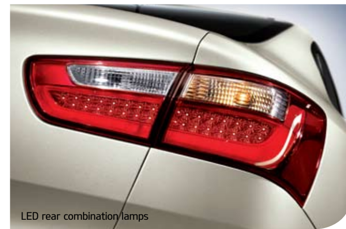
LED rear combination lamps