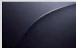
ABT_Platinum Graphite (Pearl Metallic)