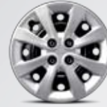
15-inch Steel Wheel