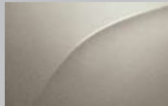
FDP_Fresh Beige (Pearl)