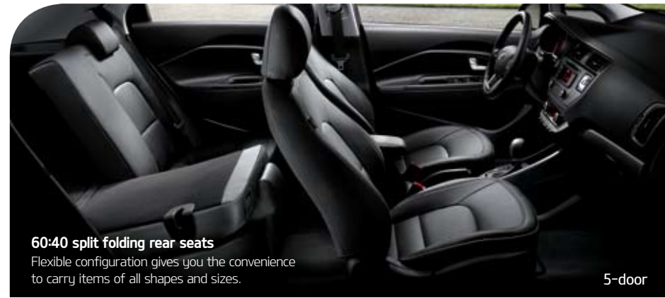
60:40 split folding rear seats Flexible configuration gives you the convenience to carry items of all shapes and sizes.