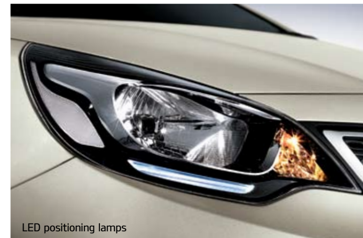
LED positioning lamps