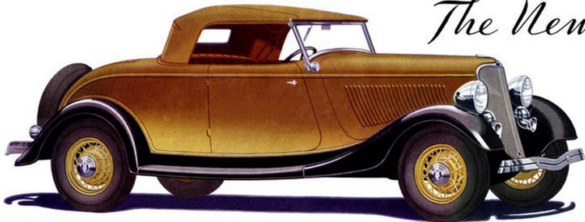
NEW V-8 DE LUXE ROADSTER By FORD —Many an admiring glance will follow this dashing new Roadster. The wide seat is upholstered in Genuine Leather . The lines of the hood are particularly distinctive and it folds neatly into a recess when not in use. Comfortable rumble seat is standard equipment. Windscreen is made of safety glass . . . There is also a New Standard Roadster.

Greater economy, larger, roomier bodies, faster acceleration, and increased power and speed are outstanding features of the New 112-inch wheelbase V-Eight cylinder car by Ford. The roomiest, most powerful car ever built by Ford, it introduces a new style of beauty, a new standard of comfort and a new pace in performance at a low price. To the smoothness and flexibility of the V-type, eight-cylinder engine, Ford design and construction have added yet another advantage . . . low cost of operation and upkeep.