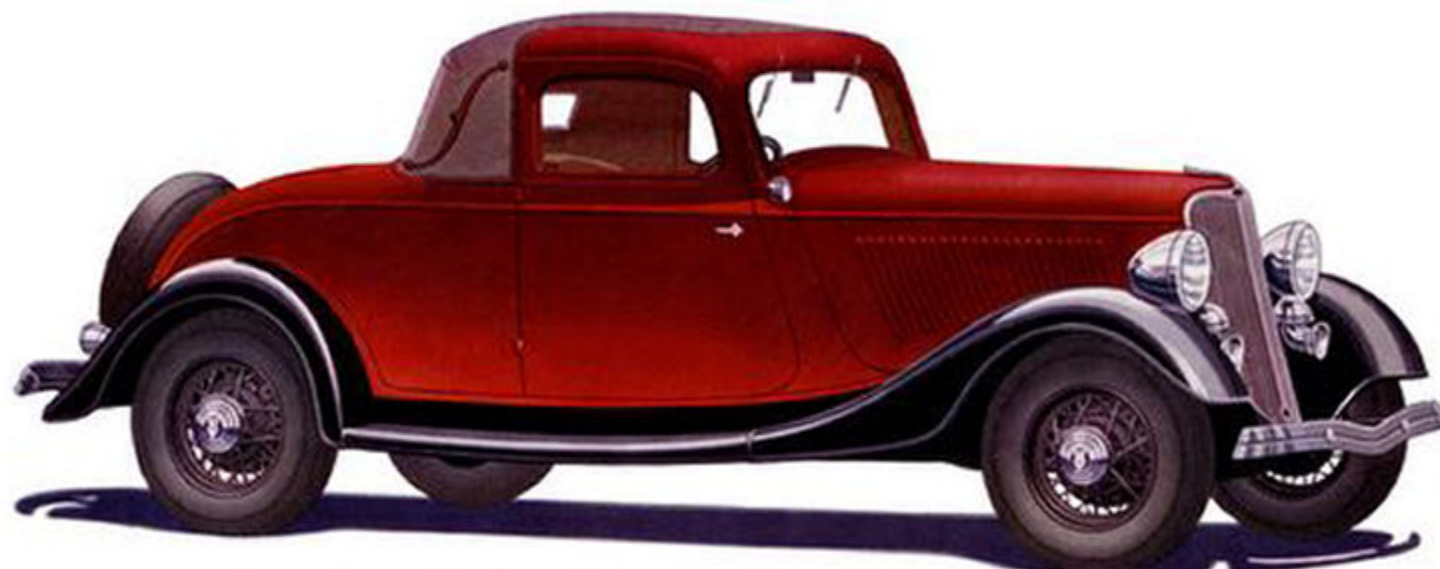
NEW V-8 DE LUXE COUPE By FORD —This attractive new Coupe has a wide, comfy seat, with convenient parcel shelf behind. Comfortable rumble seat is standard equipment. Finest quality upholstery and safety glass windscreen. Sport appearance is enhanced by fabric and metal hood finished with lexan iron. Rich, enduring body colours.

wheels, and new instrument panel directly in front of driver. All are furnished in a choice of colours. All closed cars have a dome light. De Luxe models have two tail lights, two matched-tone horns, are equipped with safety glass wind-screens , cowl lamps and full-length chromium-plated bumpers, front and rear. The De Luxe Sedan has an ash tray in the rear compartment and an ash tray and cigar lighter on the instrument board. Other De Luxe models have an ash tray and lighter on the instrument board. All De Luxe models are obtainable with luggage carrier and spare wheel at side.