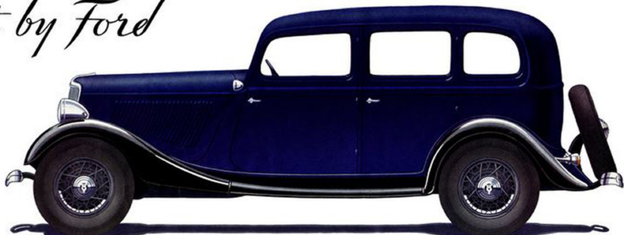
NEW V-8 DE LUXE SEDAN By FORD —A truly De Luxe car in lines, in size, and in finish. Seats are wider and roomier. Driver's seat adjustable. Rear seat has arm-rests. Windscreen is made of safety glass. Three side windows give unusual light and vision . . . There is also a New Standard Sedan.

Greater economy, larger, roomier bodies, faster acceleration, and increased power and speed are outstanding features of the New 112-inch wheelbase V-Eight cylinder car by Ford. The roomiest, most powerful car ever built by Ford, it introduces a new style of beauty, a new standard of comfort and a new pace in performance at a low price. To the smoothness and flexibility of the V-type, eight-cylinder engine, Ford design and construction have added yet another advantage . . . low cost of operation and upkeep.