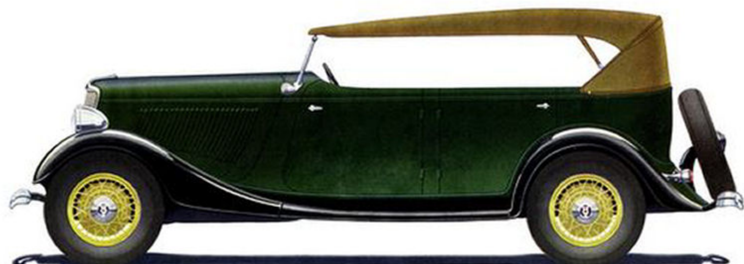
NEW V-8 DE LUXE PHAETON By FORD —A long, low, roomy open car with plenty of dash and style. The tan hood has attractive lines and it is easy to raise and lower. Made of durable waterproof material—double-thick, interlined with rubber. Genuine Leather upholstery . . . There is also a New Standard Phaeton.

fully counter-balanced crankshaft and is cushioned in rubber. These mechanical improvements eliminate vibration, giving a new smoothness, flexibility and economy of operation that is revolutionary in the performance of a four-cylinder car.