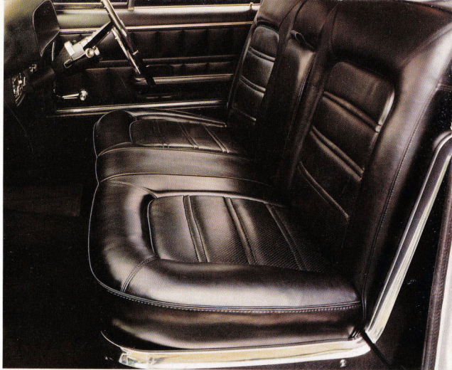
The Galaxie 500 Interior. The truly luxurious seating is specially designed for maximum comfort, featuring foldaway centre armrest and deep, foam-cushioning. The upholstery is pleated and also perforated.