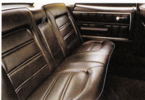
Rear seat passengers enjoy the comfort of contoured seating and ample leg and shoulder room.