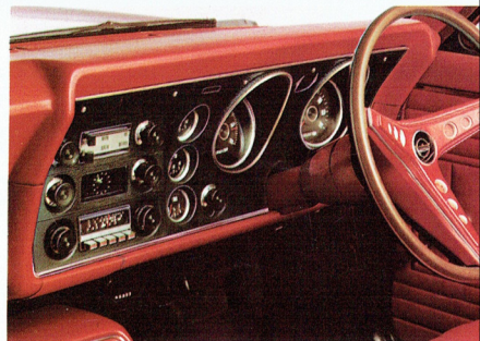
Top: Optional Buckets and Floor-Shift Manual. Above: (left) GS Stripes and Wheel covers, (right) GS Cockpit.