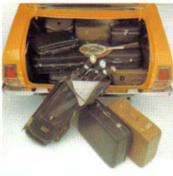
Spacious 36 cu. ft. boot.