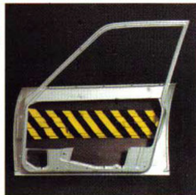
Side safety barrier, all four doors.