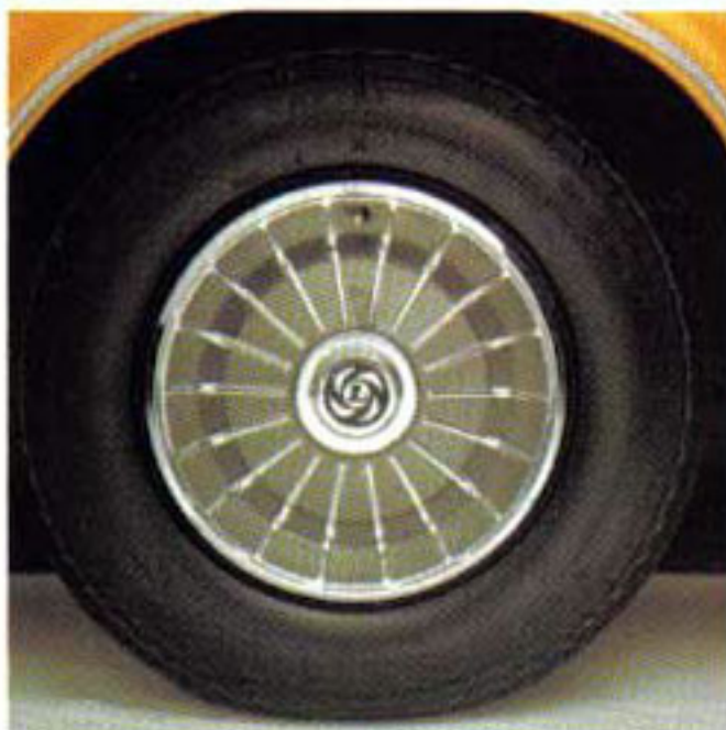
Super wheel trim.