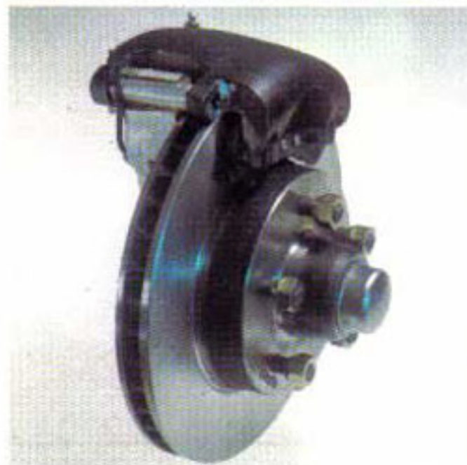
Power disc brakes on all models.