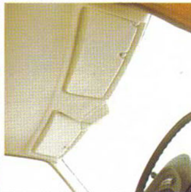
Recessed sun visors on Super & Executive.