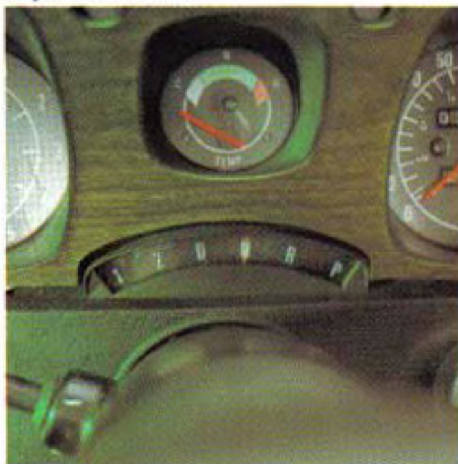
3 speed automatic: Column or floor shift.