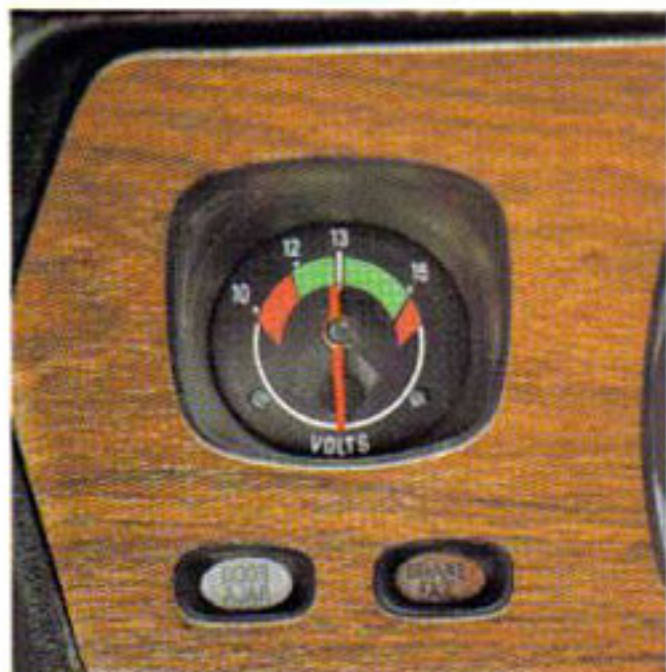
Voltmeter: Standard on Super & Executive.