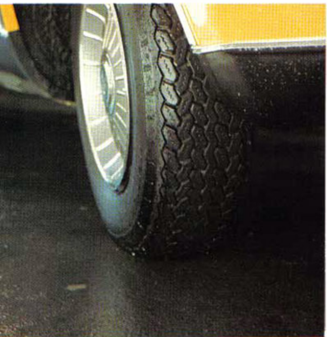
Radial Ply tyres are standard.