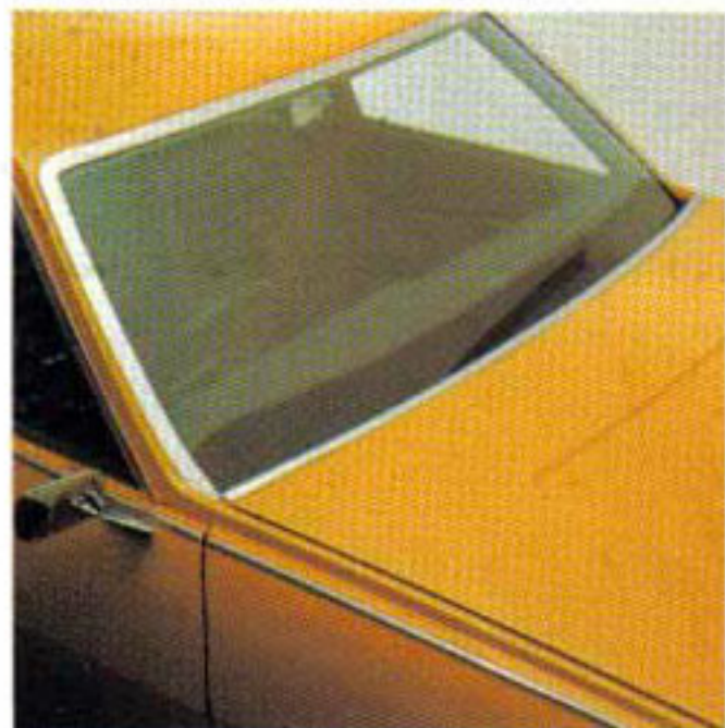
Recessed windscreen wipers.