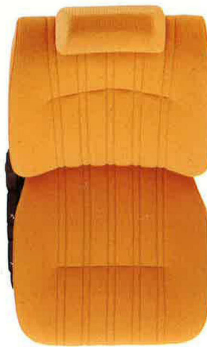
Optional cloth trim.