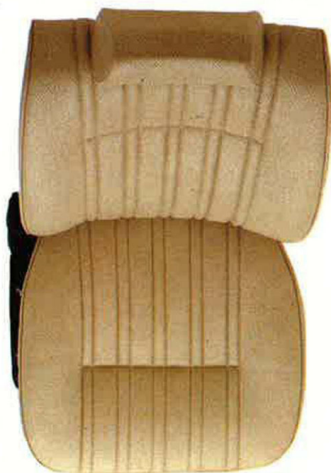
Standard vinyl trim.

absorbers and stabiliser bar. Rear - Coil springs, 4 link type, telescopic shock absorbers and stabiliser bar.