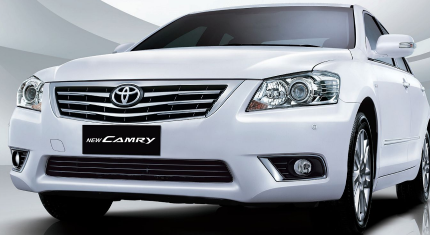
3.5 Q A/T Type