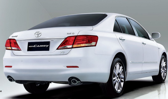
3.5 Q A/T Type