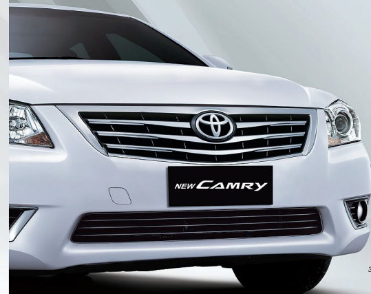
3.5 Q A/T Type

To prevent potential injuries, Dual Front & Side SRS Airbags (3.5 Q Type) ready to protect the driver and front seat passenger.