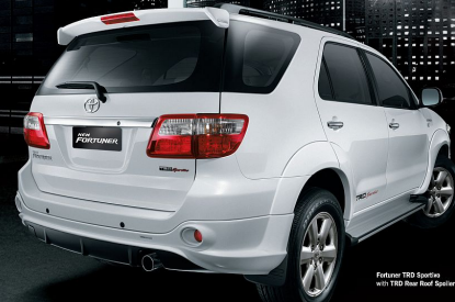
Fortuner TRD Sportivo with TRD Rear Roof Spoiler