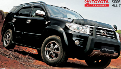
2.7 G Lux AT Type with Toyota Genuine Accessories