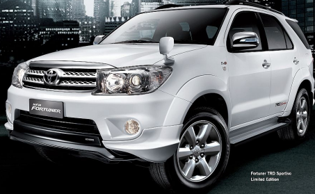
Fortuner TRD Sportivo Limited Edition