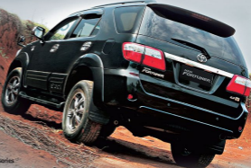
2.7 G Lux AT Type with Toyota Genuine Accessories