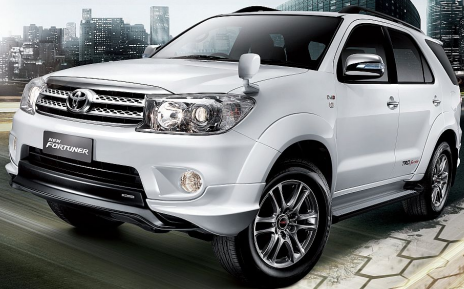
Fortuner TRD Sportivo Limited Edition with TRD Alloy Wheel (optional)