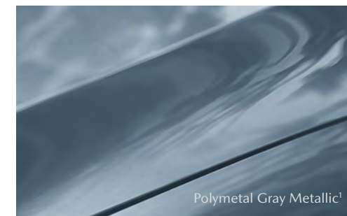
Polymetal Gray Metallic 1

Every detail of our design process is intentional. Including the paint. Before a single drop is applied, master painters perfect their technique by hand, ensuring the surface of the Mazda CX-9 has depth and saturation. They apply color with precision, illuminating the curves and characteristics of our Kodo design. The machines used to paint the CX-9 are calibrated to replicate the movement of this human technique. Our stunning array of lustrous finishes may be the final touch on the CX-9, but it is the first thing that will catch your eye.