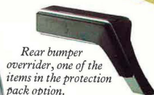
Rear bumper override, one of the items in the protection pack option.