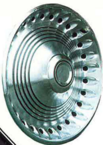
Standard Satellite wheel cover.