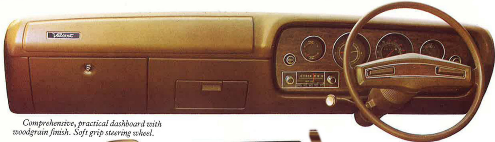
Comprehensive, practical dashboard with woodgrain finish. Soft grip steering wheel.