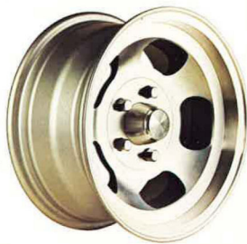
Optional 7" wide track mag wheel.