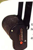
Retractable vehicle-sensitive seat belts are now standard equipment.