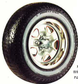
Optional 6.5" silver styled road wheel with E 70 HR radial.