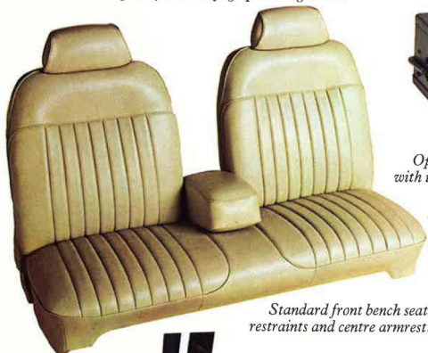
Standard front bench seat with applied head restraints and centre armrest.