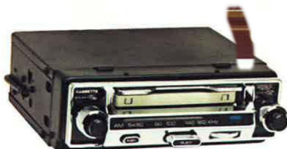
Optional stereo cassette player with incorporated AM search-tune radio.