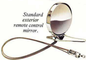
Standard exterior remote control mirror.