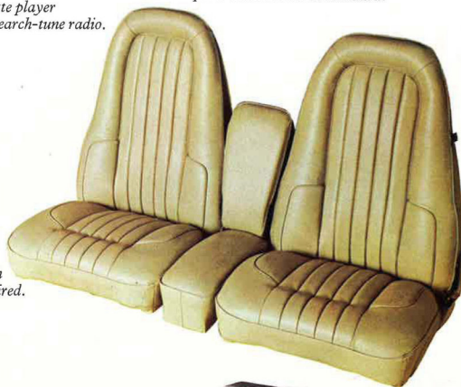
Optional high-backed front bucket seats with centre armrest if desired.