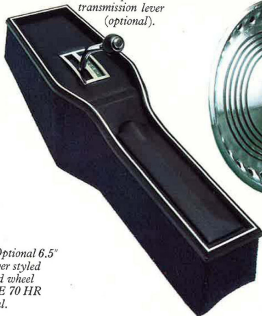
Console mounted automatic 3-speed transmission lever (optional).