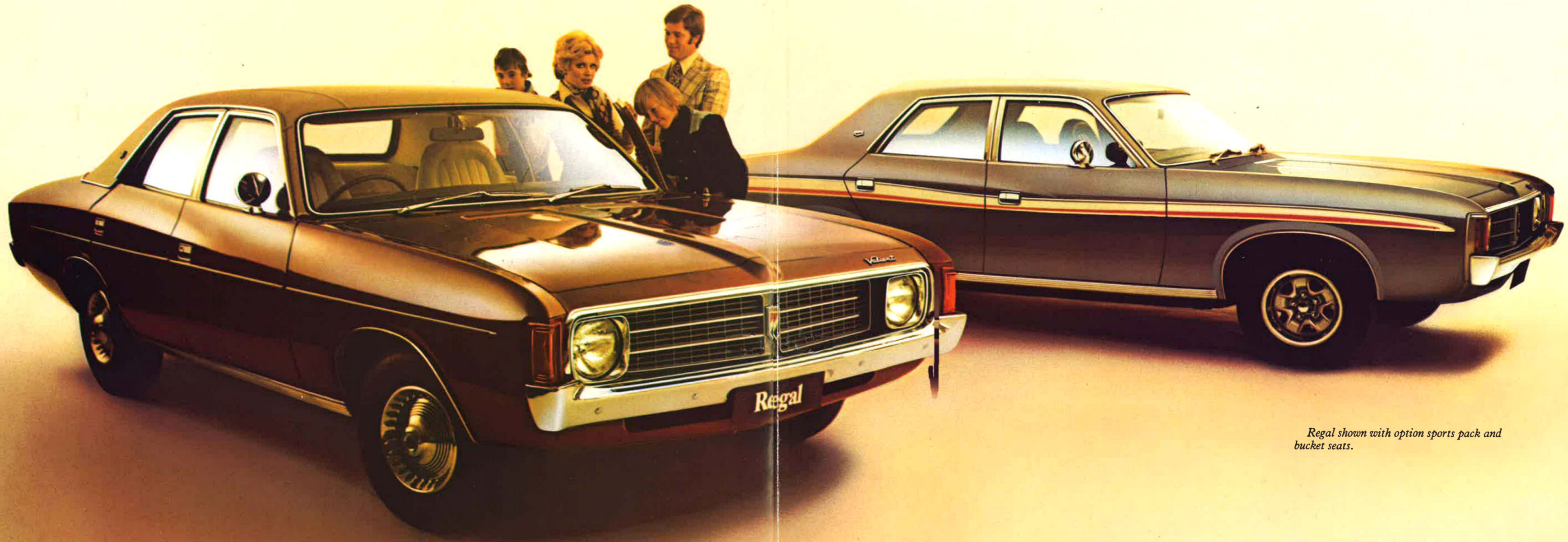
Regal shown with option sports pack and bucket seats.

Standard engine is the Hemi 245 six single barrel. Optional: The Hemi 265 six 2-barrel, or time-tested 318 V8.