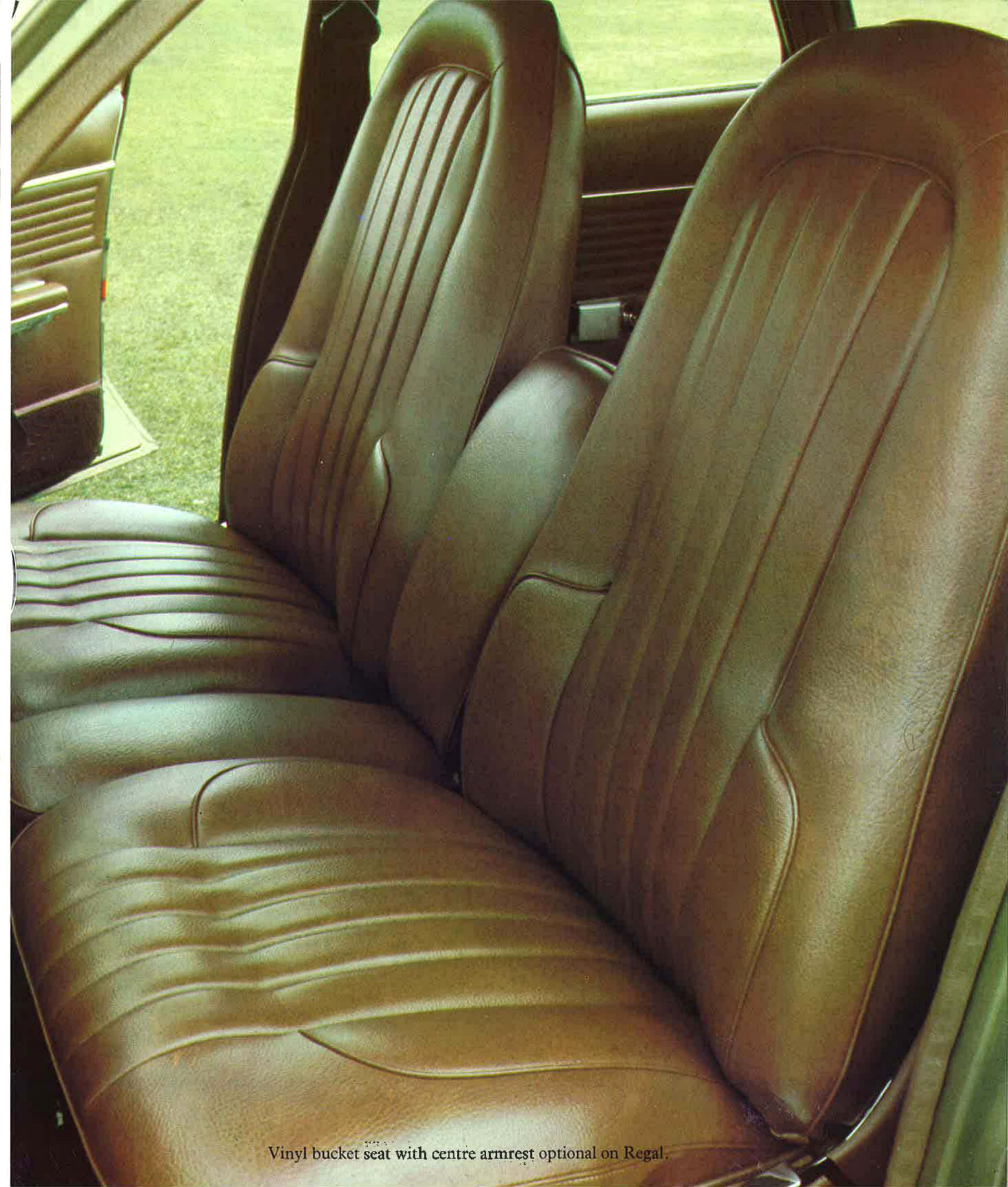
Vinyl bucket seat with centre armrest optional on Regal.