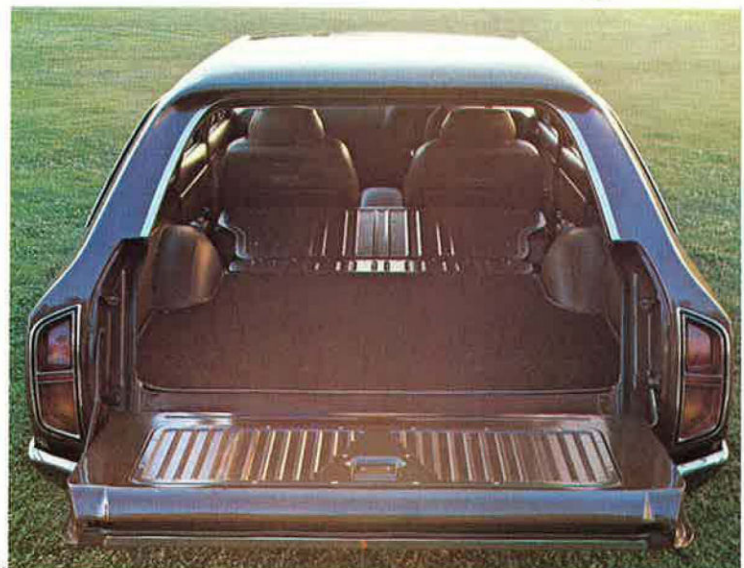
At right. Optional protection package and styled wheels.