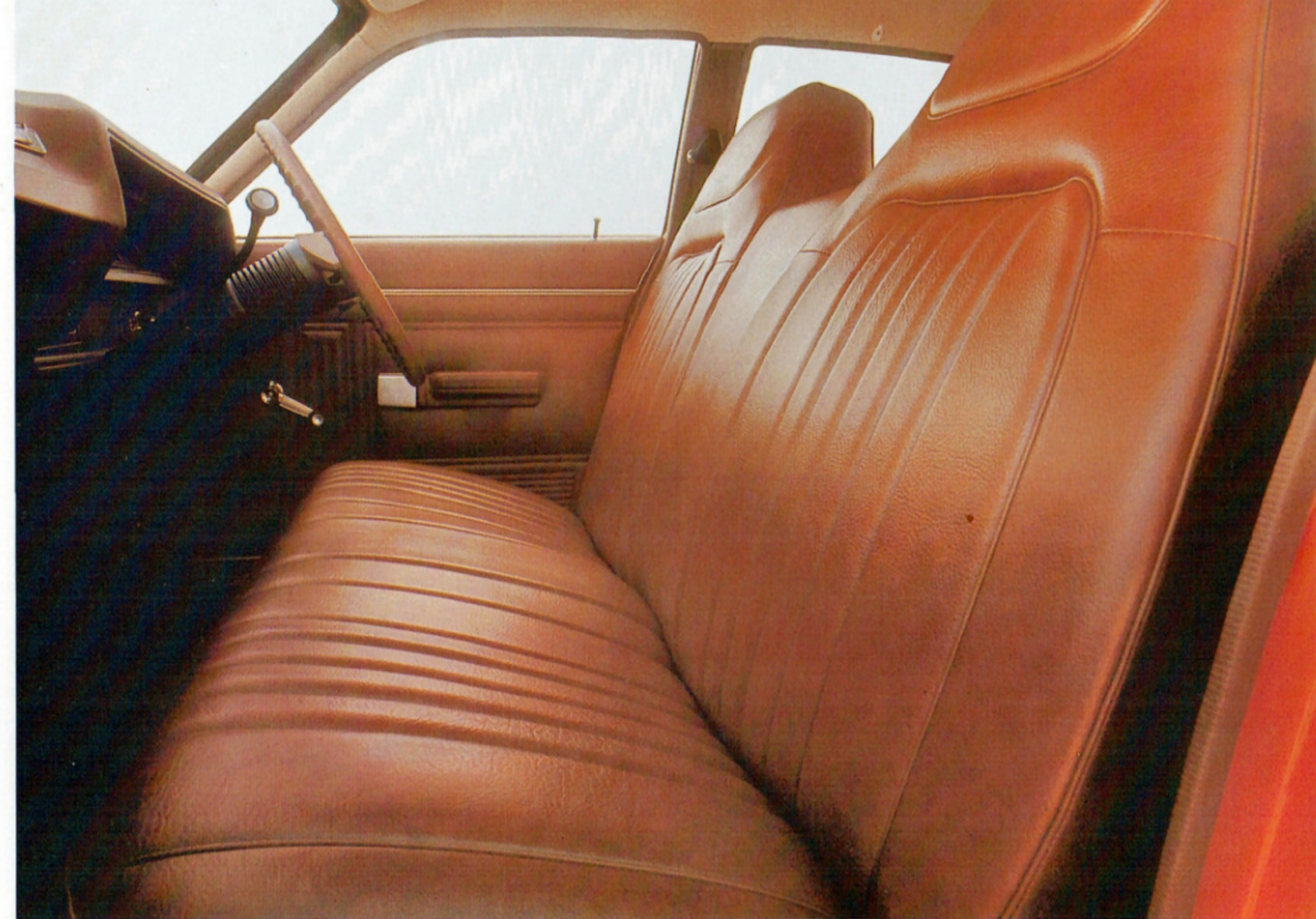
Ranger's expansive interior, and comfort let you make the longest trip with ease.

There are foam padded bench seats or optional buckets (both with integral