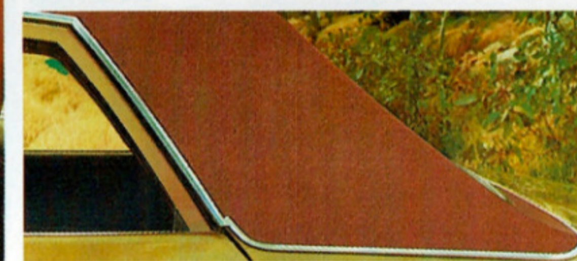
To add your style to an already stylish car, some of your options are shown here.