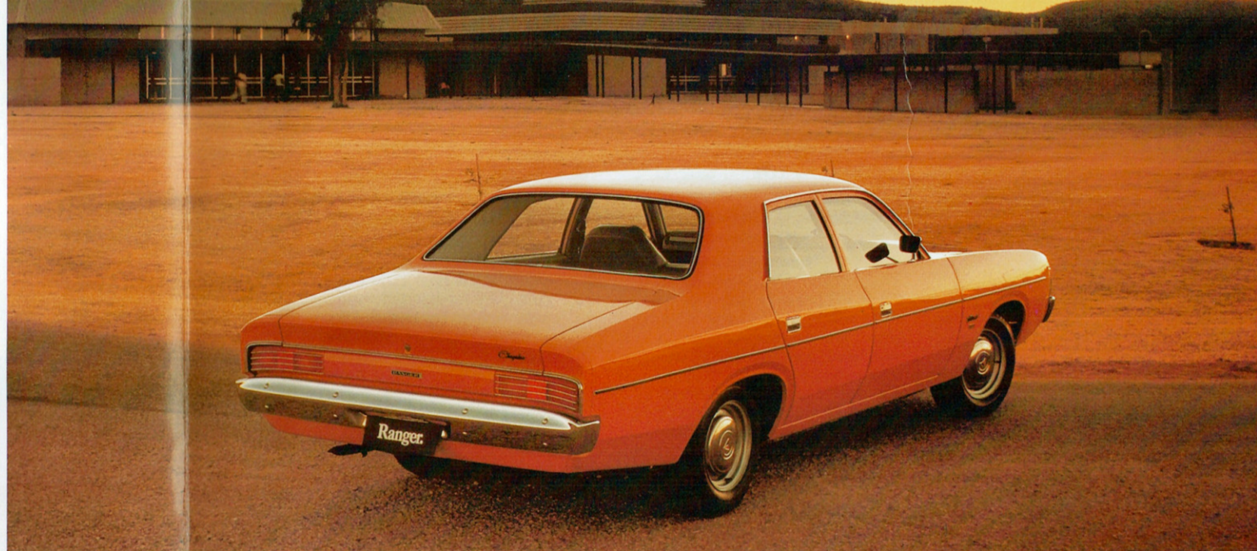
From the body-side moulding to the newly styled rear-end Ranger shows elegance.