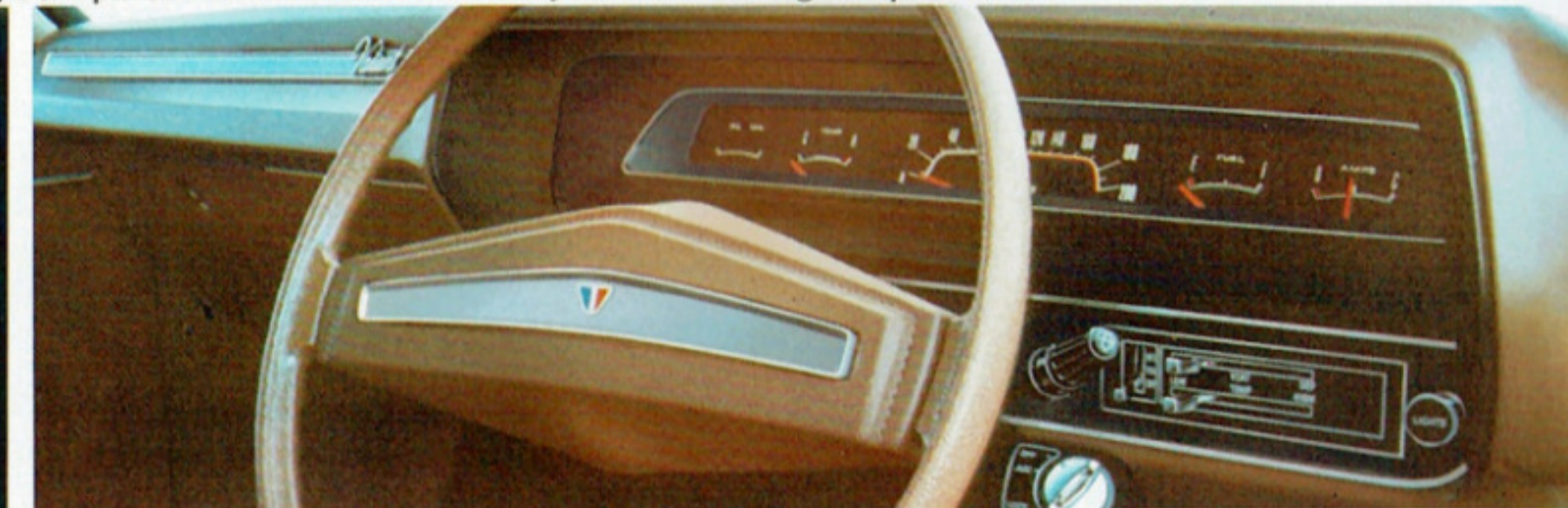
Ranger's dashboard combines both beauty and function.