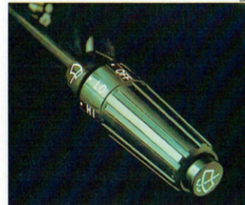
Fingertip operation for vital controls.