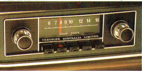
Optional push-button radio or combination stereo cassette/radio.