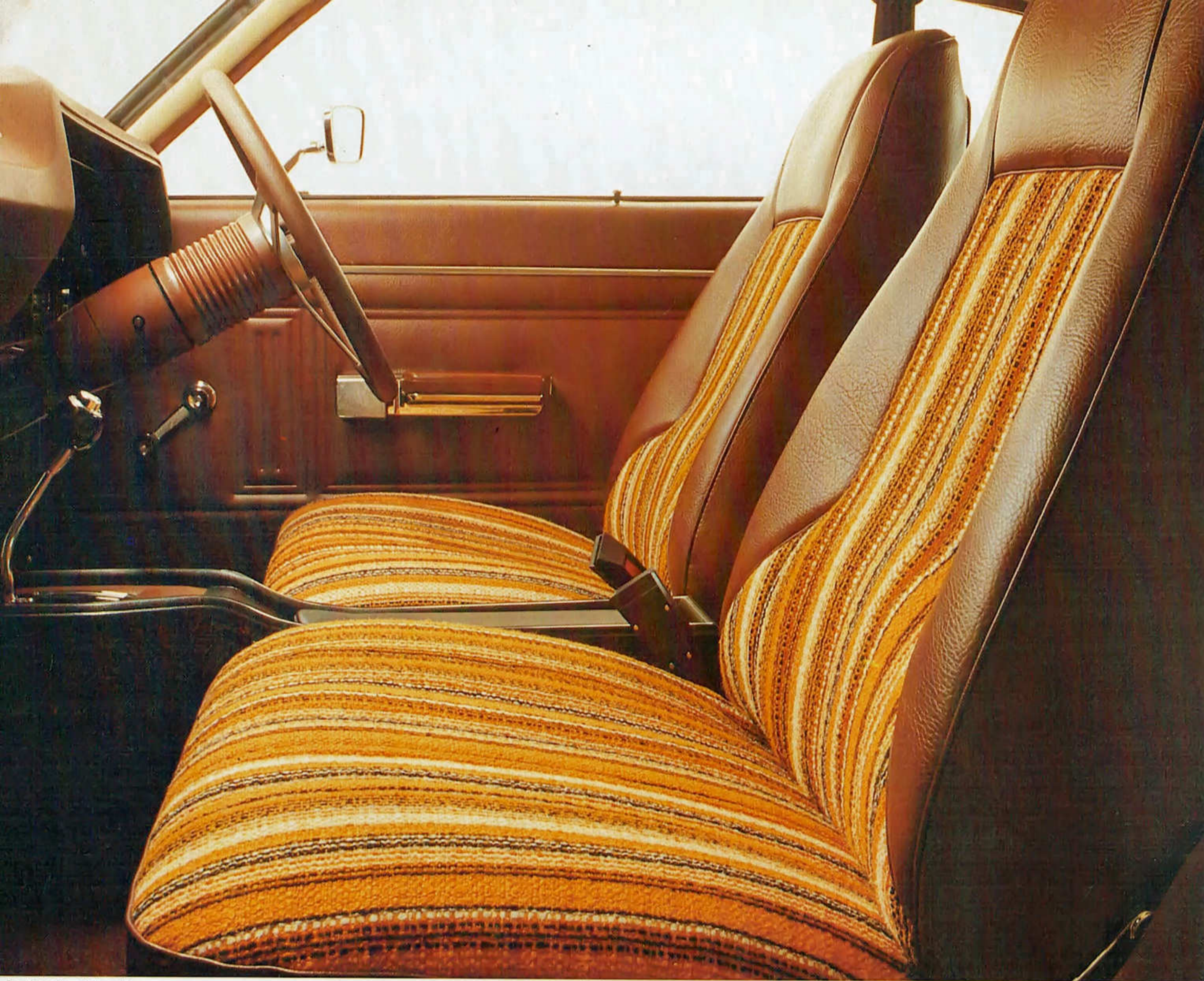
Reclining bucket seats