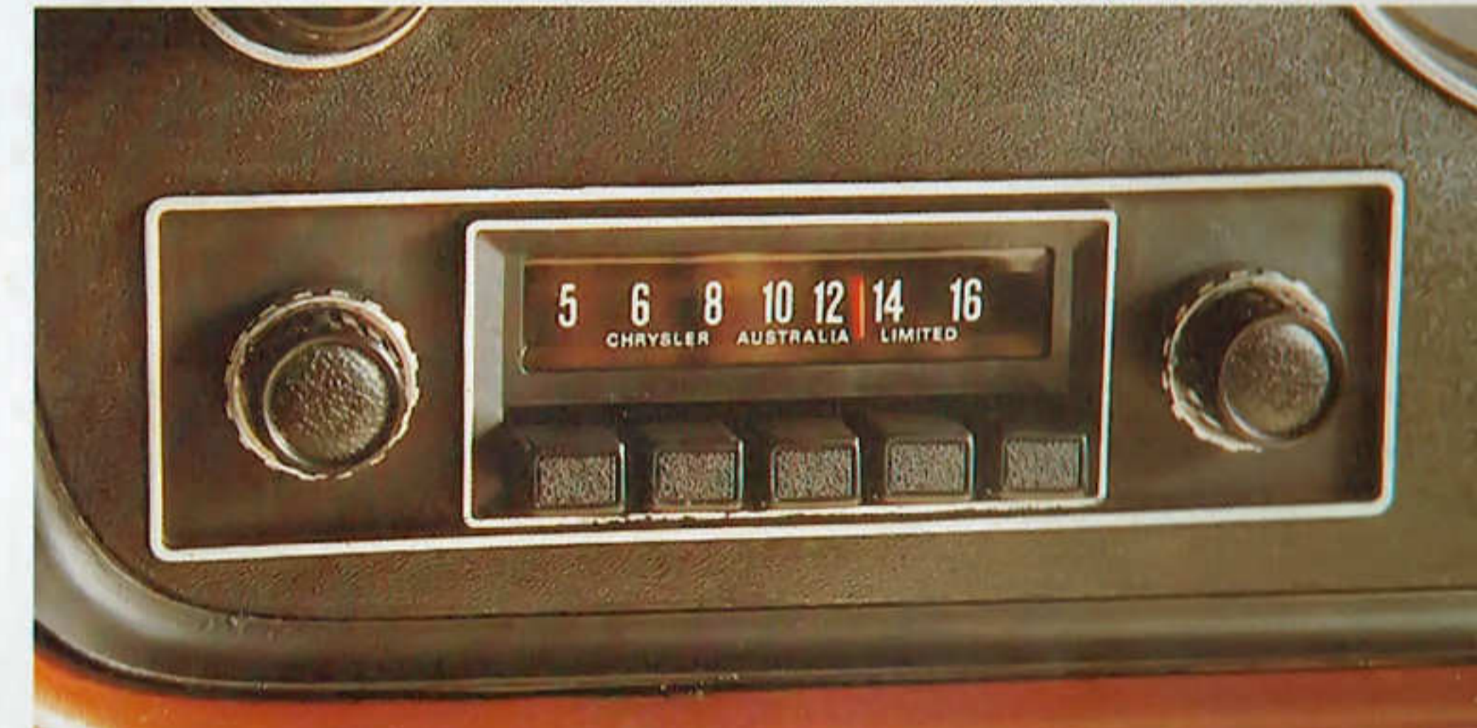
Optional push-button radio or stereo cassette radio