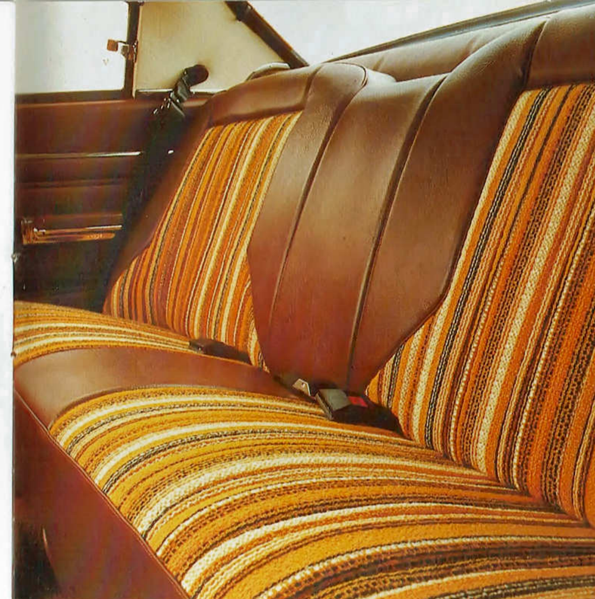
Chunky Boca Raton cloth upholstery, standard