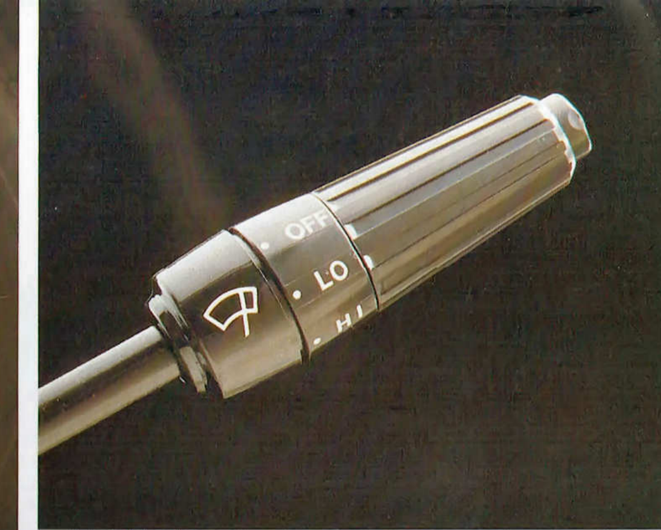
Multi-use stalk control