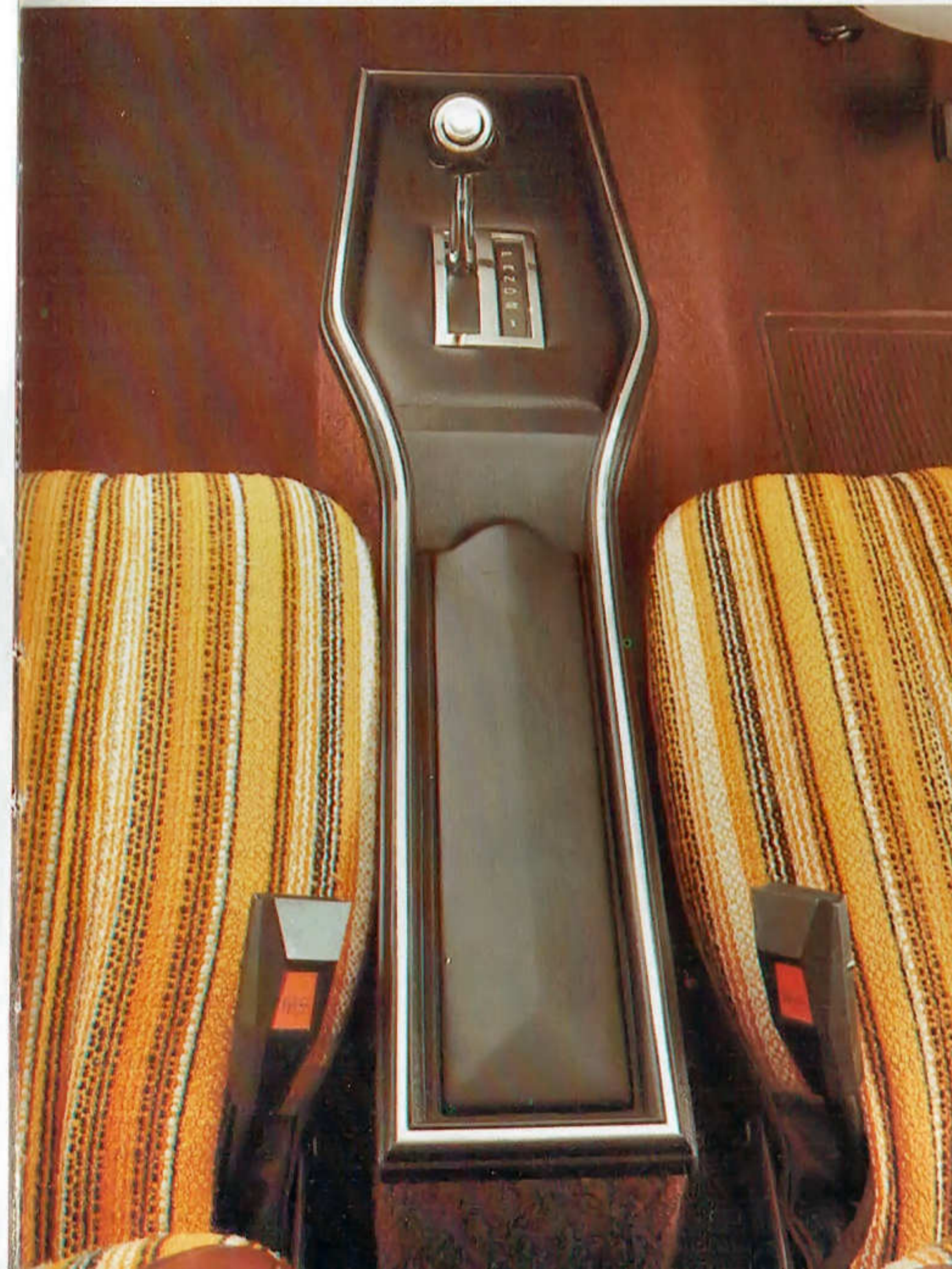
Auto shift console and storage compartment, optional