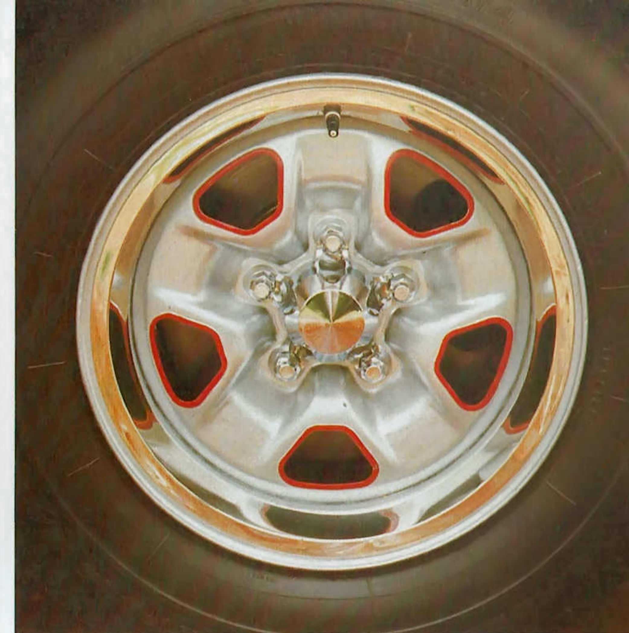
6-inch styled road wheels, standard