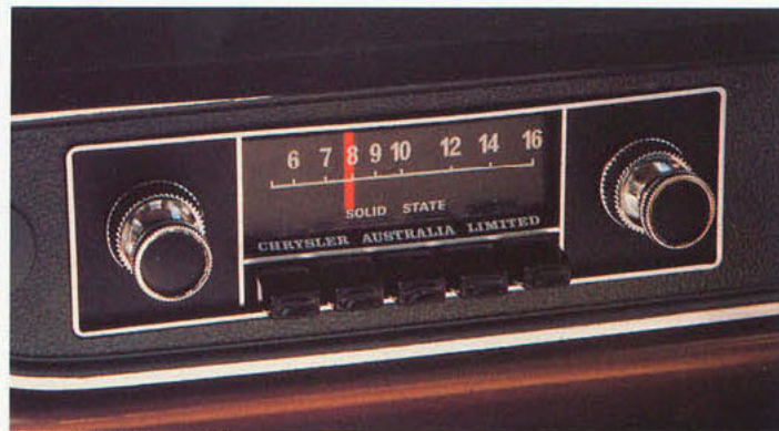
Optional push-button radio.