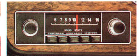
Standard push-button radio.