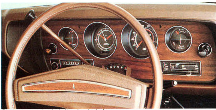
Dial instrumentation, including electric clock.