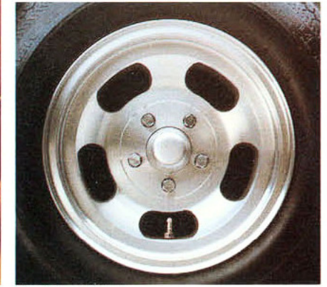
Optional mag wheels.

When your family's too big and too many for your car, and you've things to carry as well, Chrysler's wagons solve your problems perfectly.