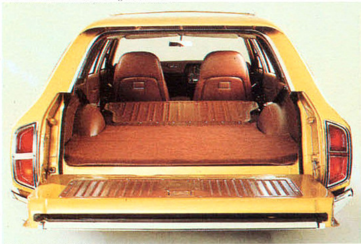
Folded rear seat gives ample loadspace.