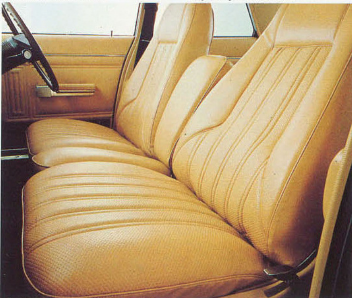
Reclining bucket seats with folding centre armrest.