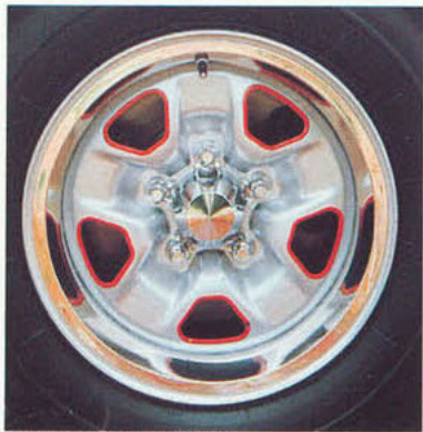
Optional styled road wheels.

Many motorists use more petrol than necessary, because the engine can only cope with a certain amount at a time. Chrysler's fuel pacer option signals when it happens, helps you cut fuel consumption.