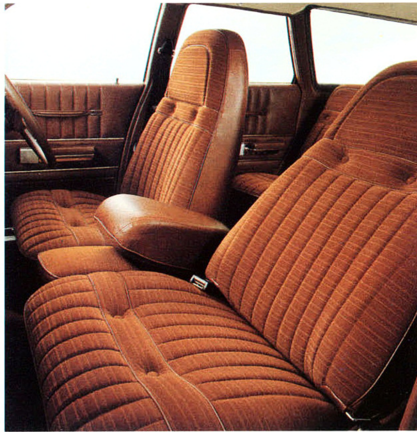
Arm-chair comfort of Ivanhoe cloth upholstery.