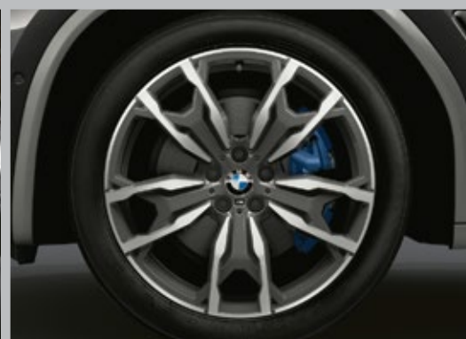
20" M light alloy wheels Double-spoke style 787 M incl. M Sport Brake