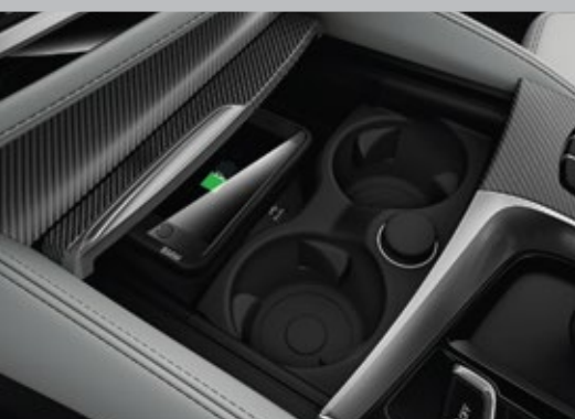
Smartphone holder at the front holders with inductive charging capability, Qi standard

Please refer to this insert for local market specifications.