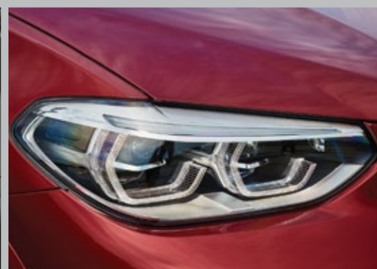
Adaptive LED headlight incl. BMW Selective Beam