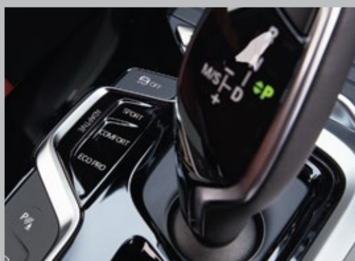
Vertical Dynamic Control with different Driving Dynamics Control settings