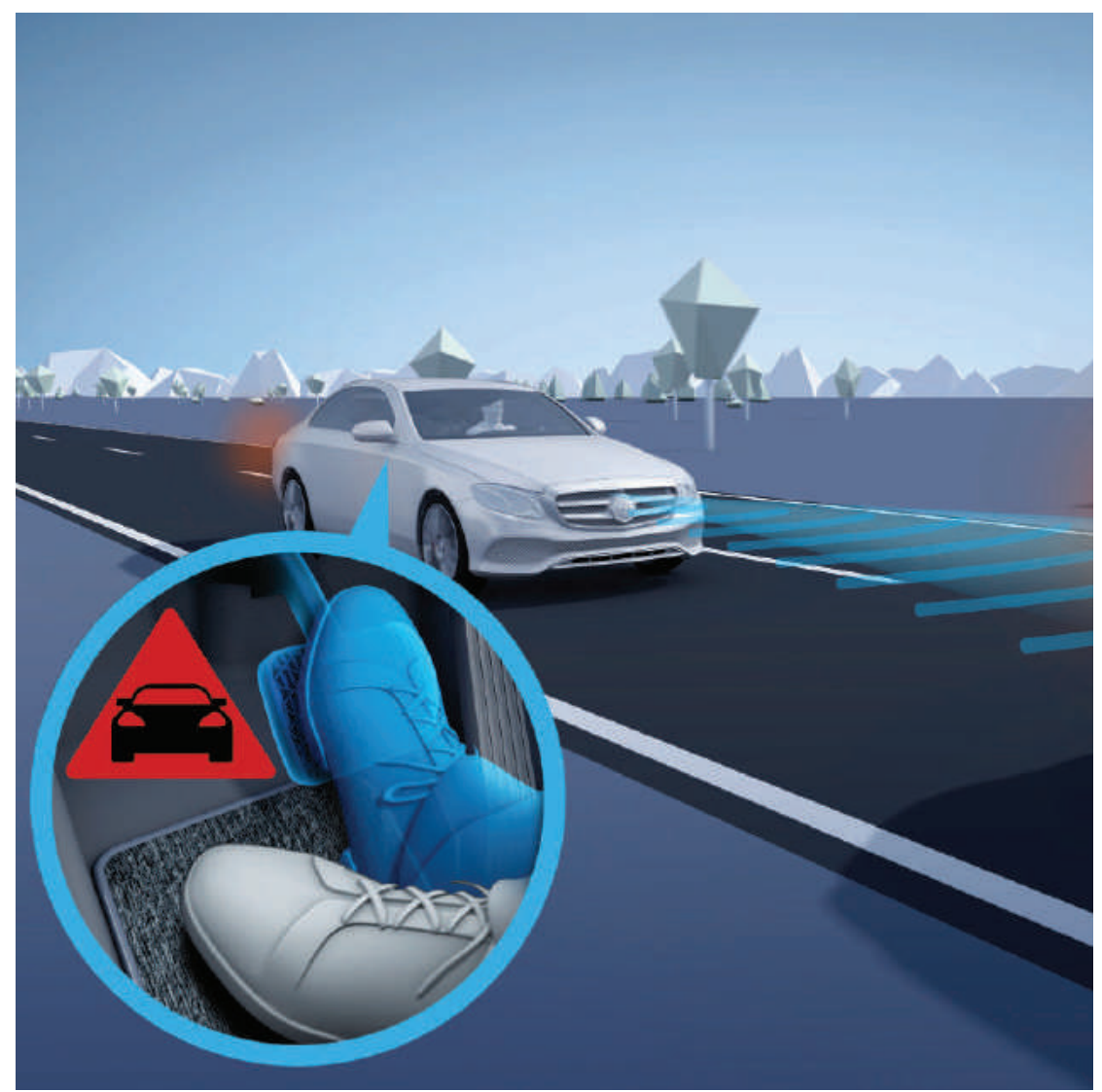
Active Brake Assist