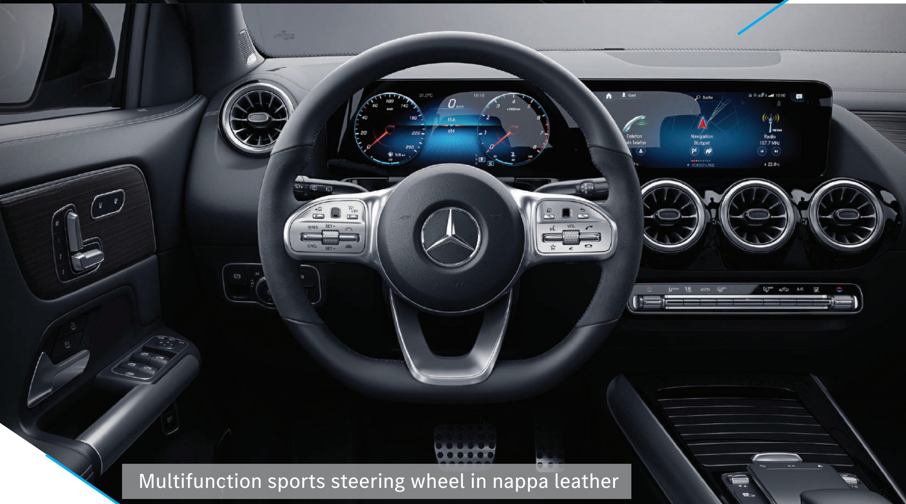
Multifunction sports steering wheel in nappa leather