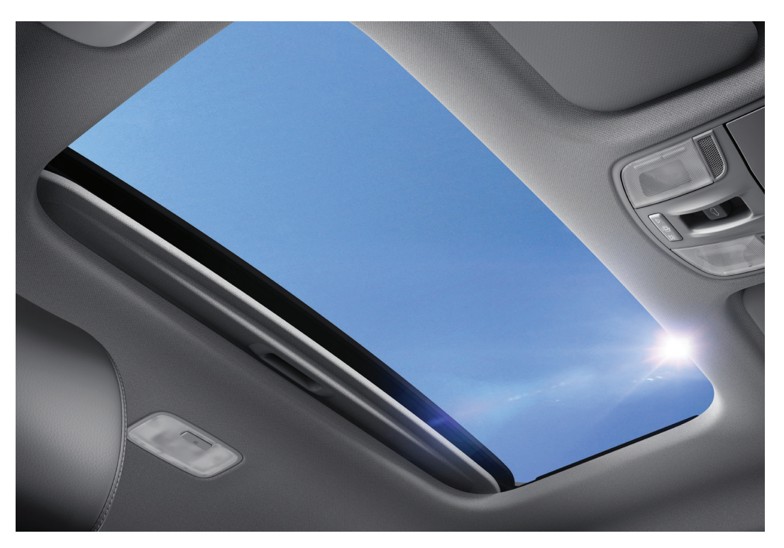
Power sunroof <sup>1</sup> adds an open-air feeling to the already roomy cabin.