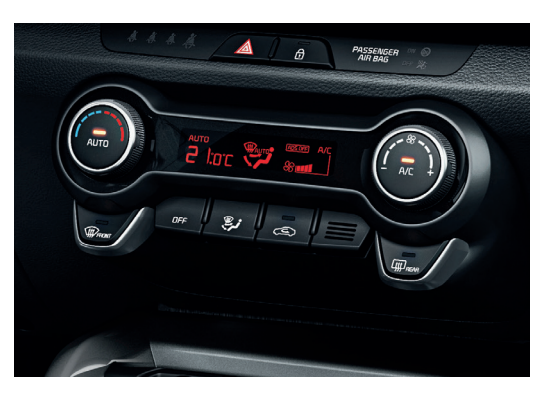
Automatic climate control<sup>1</sup> lets you set your ideal cabin temperature.