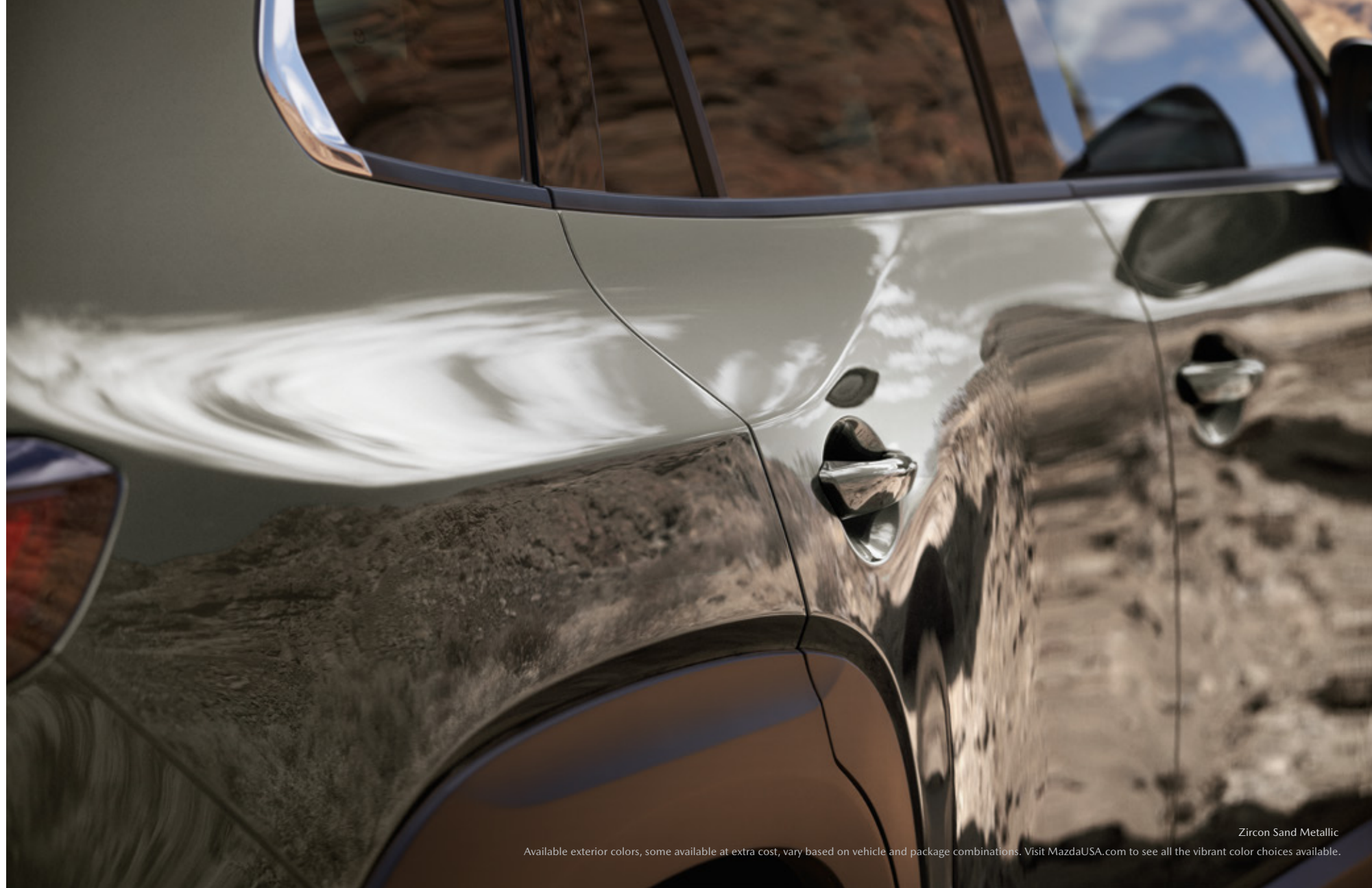
Zircon Sand Metallic

Additionally, it was important to us that even the color of the CX-5 heightens your connection with nature. So, we created a new color specifically for this reason. The available Zircon Sand Metallic summons notions of venturing down rustic primitive trails far from the beaten path.