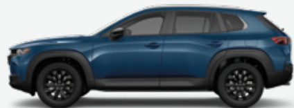
CX-50 2.5 S SELECT