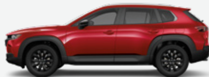
CX-50 2.5 S PREFERRED PLUS