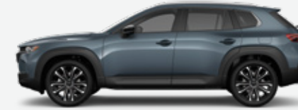
CX-50 2.5 TURBO PREMIUM PLUS