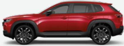
CX-50 2.5 TURBO