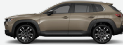
CX-50 2.5 TURBO PREMIUM