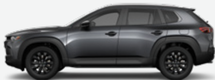
CX-50 2.5 S PREFERRED