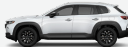
CX-50 2.5 S PREMIUM