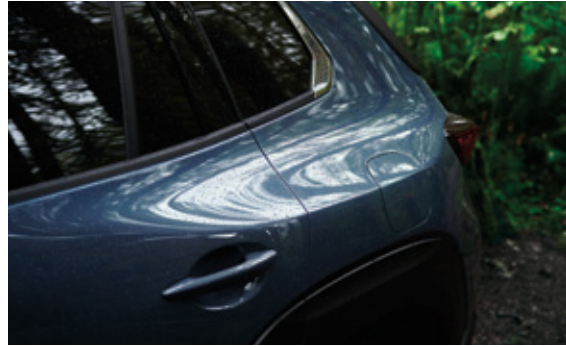
Polymetal Gray Metallic