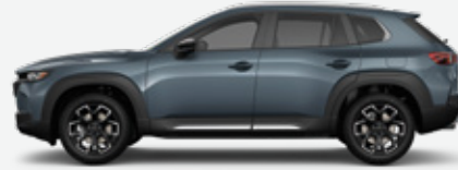
CX-50 2.5 TURBO MERIDIAN EDITION