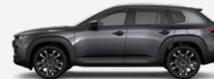
CX-50 2.5 S PREMIUM PLUS