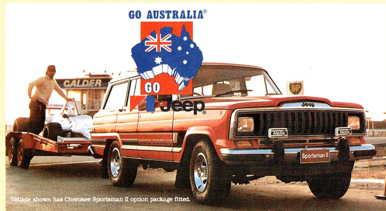
Vehicle shown has Cherokee Sportsman II option package fitted.

The Cherokee Sportsman II, it's a real eye-catcher!