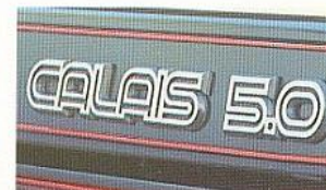
Optional 5.0 litre V8 engine.