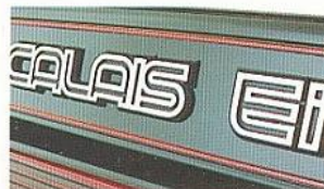
Electronic injection 3.3 litre engine.

*Results of GM-H laboratory tests compared to VH Commodore.