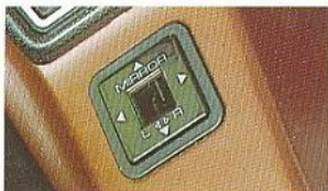
Finger touch electric adjustment exterior mirrors.

The 1985 Holden Calais, comprehensive equipment list includes electric exterior mirror adjustment, power windows, power central door locking, remote electric boot release, personal reading lamps and 4-wheel disc brakes.