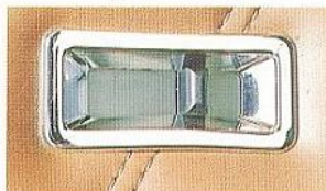
Power operated central door locking.