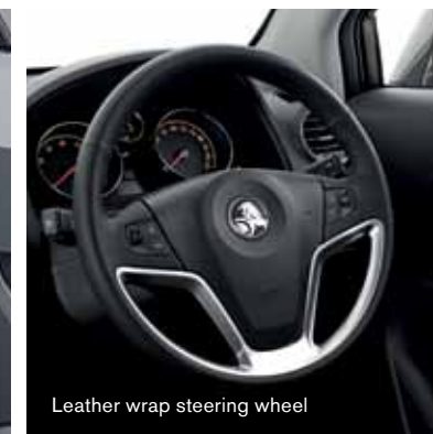
Leather wrap steering wheel