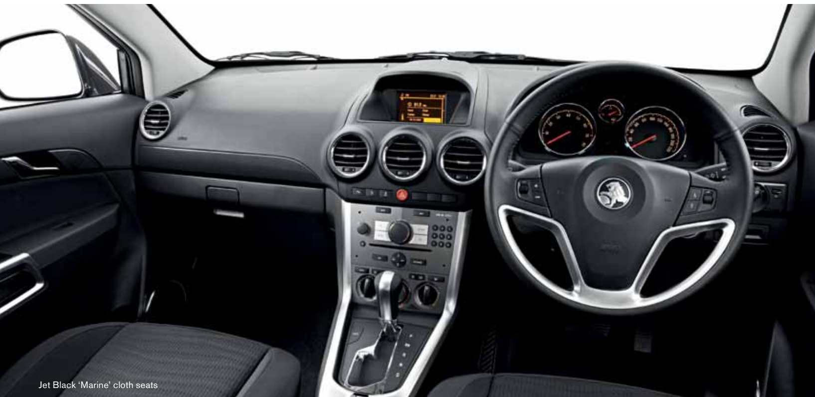
Jet Black 'Marine' cloth seats