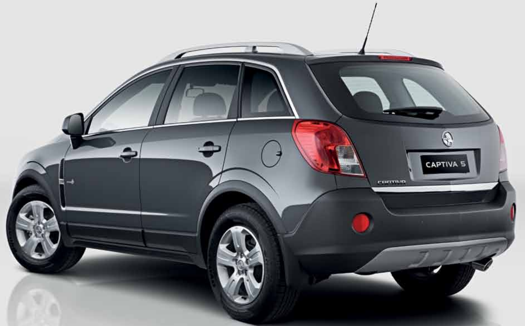
Series II Captiva 5 in Thunder Grey

It's the SUV, just the way you want it. Combining sporty performance and dynamic yet refined sedan like handling with a high driving position, extensive standard equipment and a spacious cabin, the versatile euro-style Series II Captiva 5 is up for all of life's journeys.