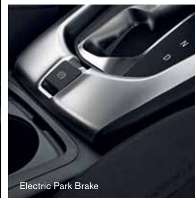
Electric Park Brake