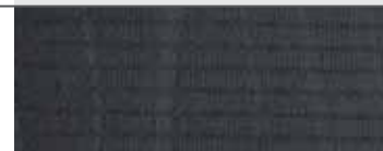
Jet Black 'Marine'