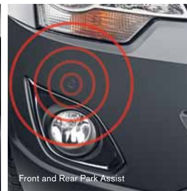
Front and Rear Park Assist