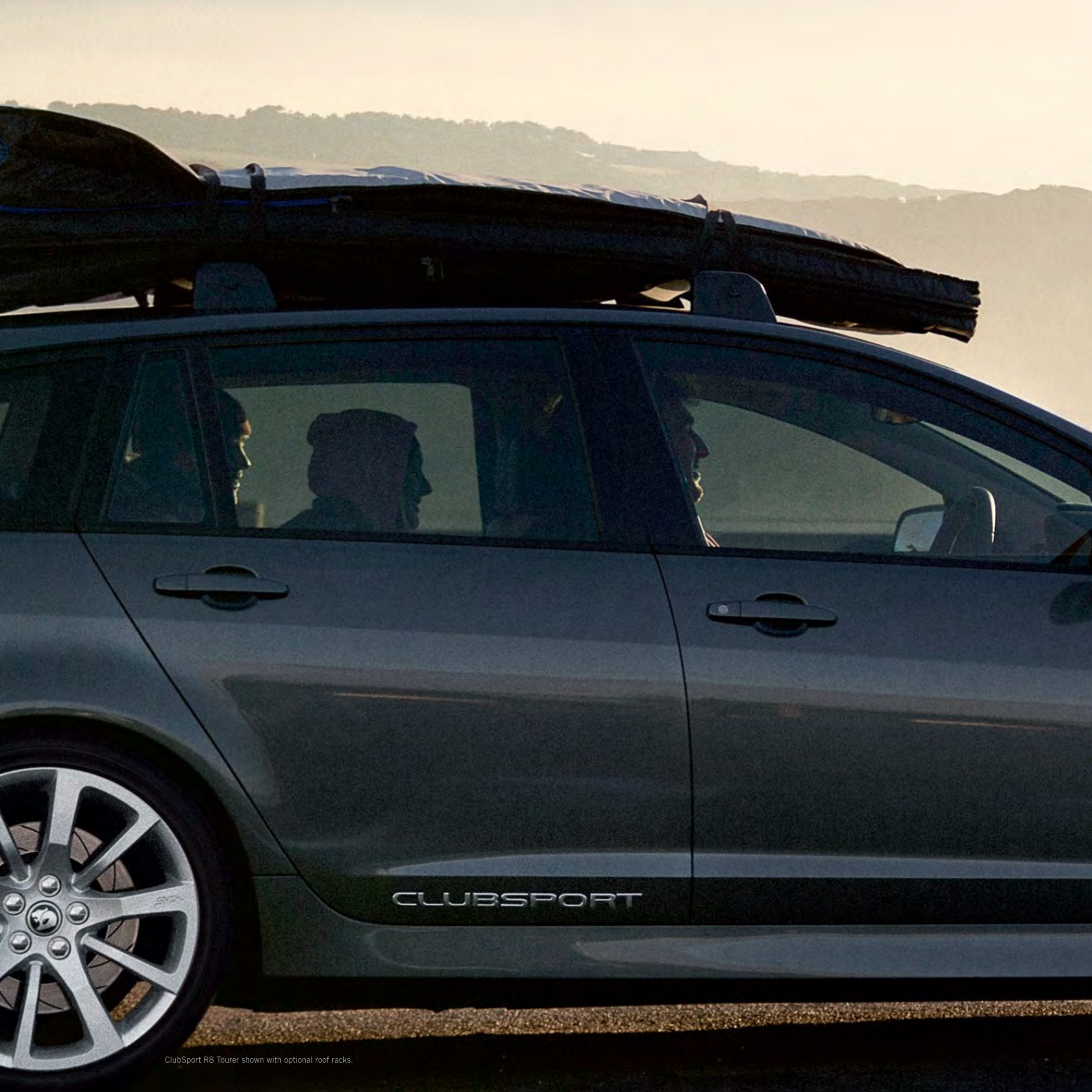
ClubSport R8 Tourer shown with optional roof racks.