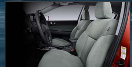
Heated, Power Seats