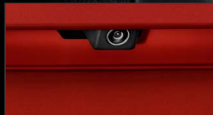
Touch-screen Navigation with Rear-view Backup Camera