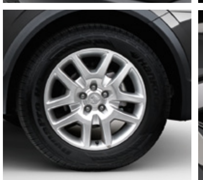
18-inch alloy wheels (pack model shown)