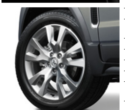
19-inch alloy wheels