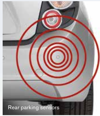
Rear parking sensors

The CDX eases into and out of tight parking spaces, thanks to its rear parking sensors. Audible warnings indicate the proximity of potential obstacles.