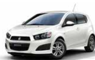
Snowflake White Pearl*