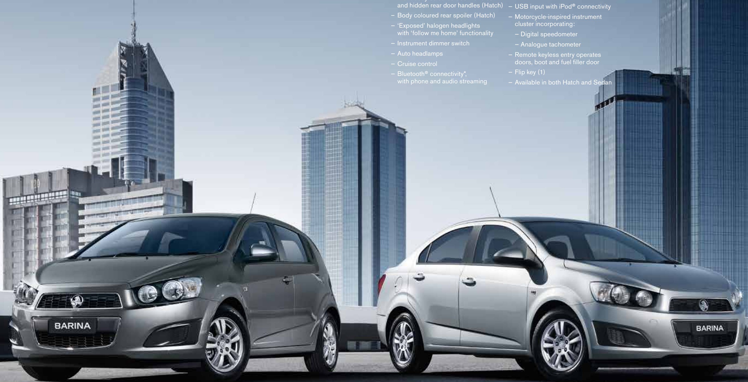
Barina CD Hatch in Satin Steel