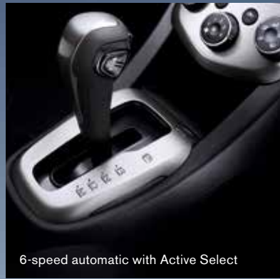
6-speed automatic with Active Select

The 6-speed automatic transmission comes with Active Select, which allows you to manually switch gears for a more 'hands on' driving experience