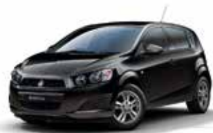
Carbon Flash Black*