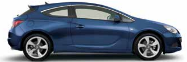
GTC Sport in Buzz Blue with manual transmission shown

The GTC Sport takes the excitement level up another notch. With extra flourishes such as 19-inch alloys, leather appointed trim, heated front sports seats and alloy sports pedals, it more than lives up to its name.