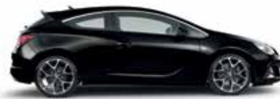
Carbon Flash Black