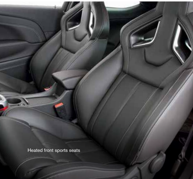
Heated front sports seats

Be prepared to be totally blown away. The absolute pinnacle of high performance engineering in the compact 3-door class, this is Holden's finest and hottest hatch ever.