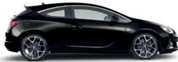
Astra VXR in Carbon Flash Black