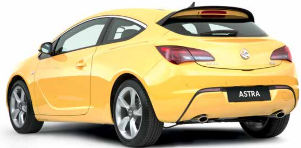
GTC Sport in Sunny Melon with manual transmission shown