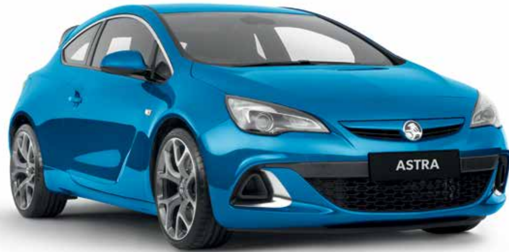
Astra VXR in Arden Blue