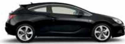
Carbon Flash Black