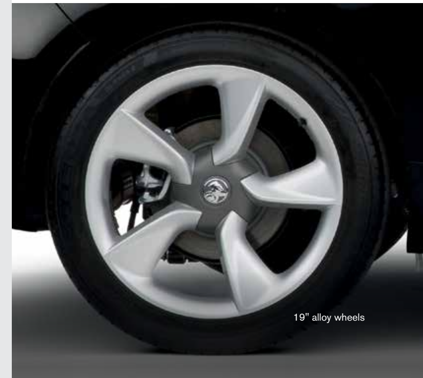
19" alloy wheels