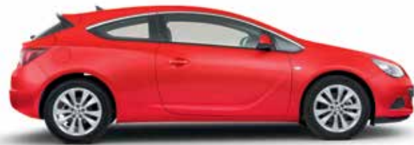
Astra GTC in Power Red with auto transmission shown