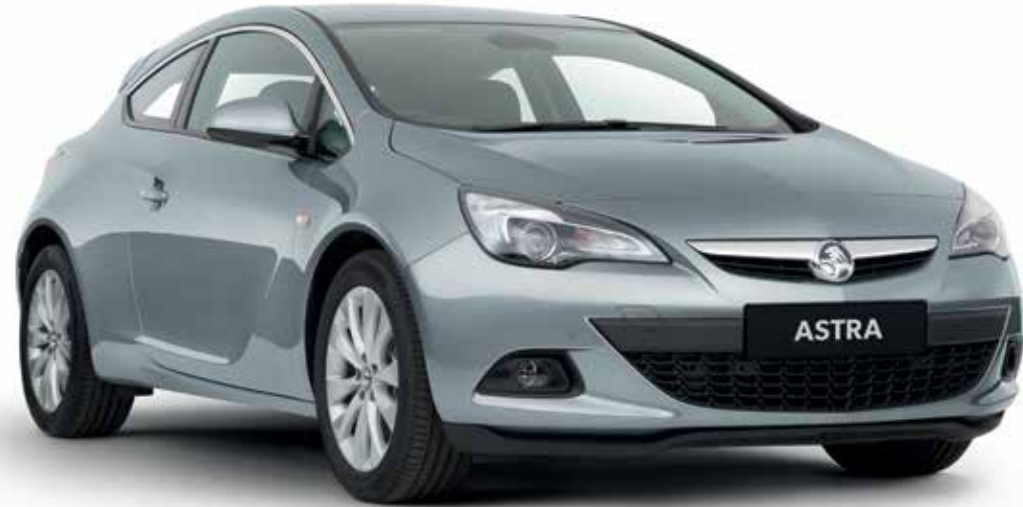
Astra GTC in Silver Lake with auto transmission shown