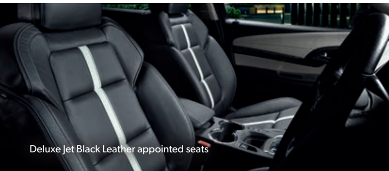
Deluxe Jet Black Leather appointed seats

When we imagined the Caprice V, we imagined the pinnacle of sports luxury and performance. Where the driver is completely immersed in the journey. There's sublime power matched with exceptional efficiency through the 6.2 litre LS3 V8 engine.