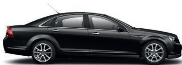
Caprice V-Series in Phantom Black