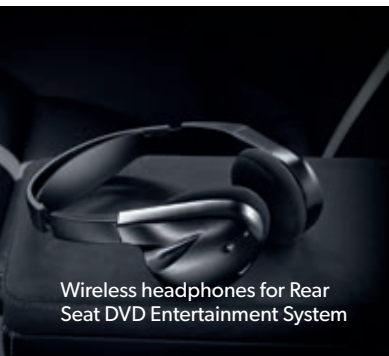
Wireless headphones for Rear Seat DVD Entertainment System