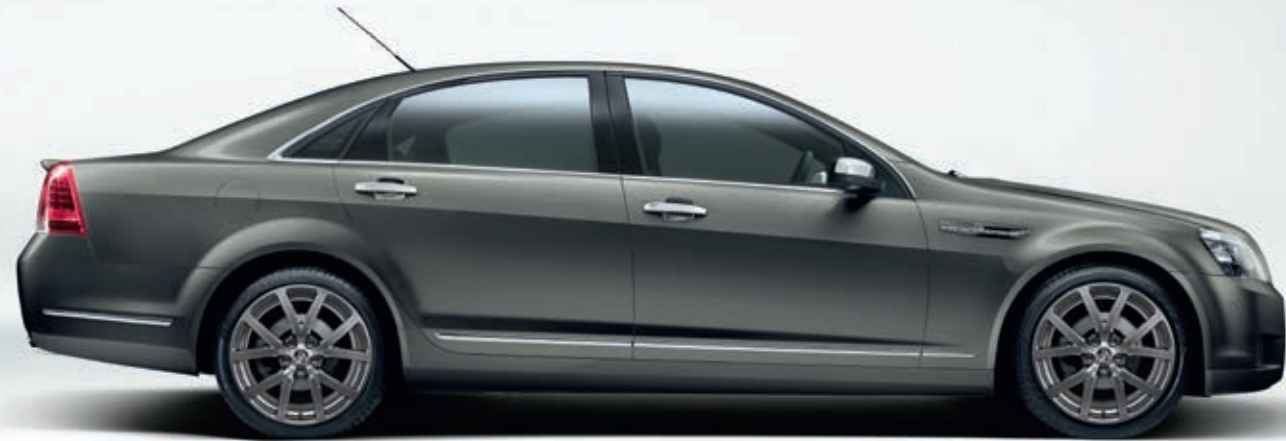
Caprice V-Series in Prussian Steel with chrome mirror caps and HF-20 forged alloy wheels in Midnight Dark Grey

Genuine Holden Accessories give you the extra flexibility to further personalise your new Caprice to fit your world.