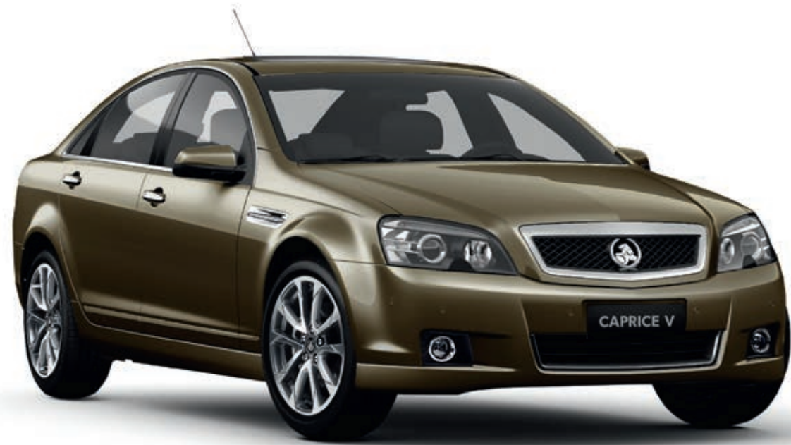
Caprice V-Series in Empire Bronze