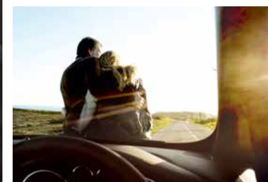
Jet Black Siena leather appointed interior