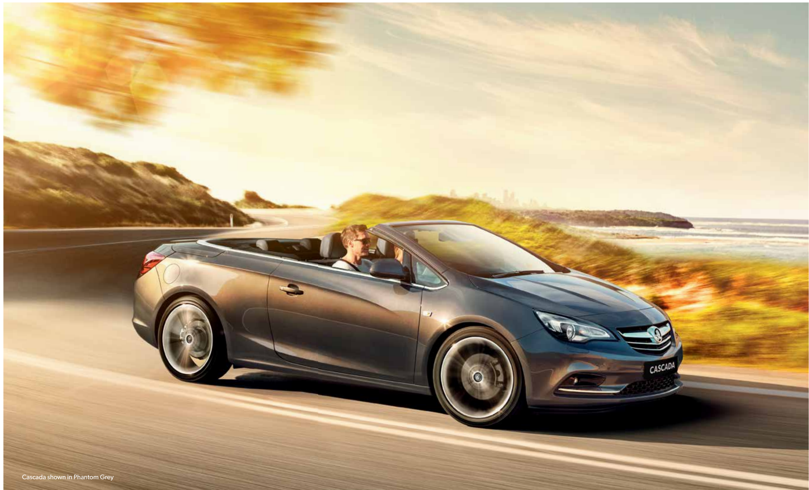
Cascada shown in Phantom Grey