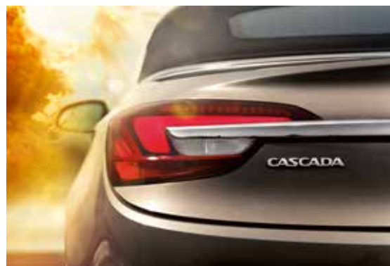
Above: Full width rear chrome bar integrates with dual LED tail-lamps in inimitable style. Cascada shown in Phantom Grey

Seductive European styling at its finest.