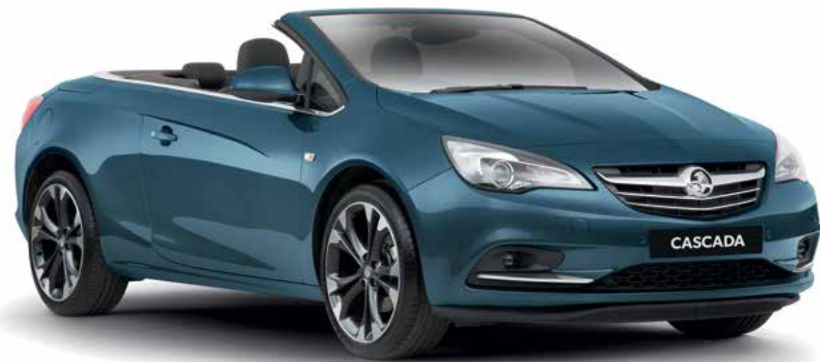
Cascada in Deep Sky Blue