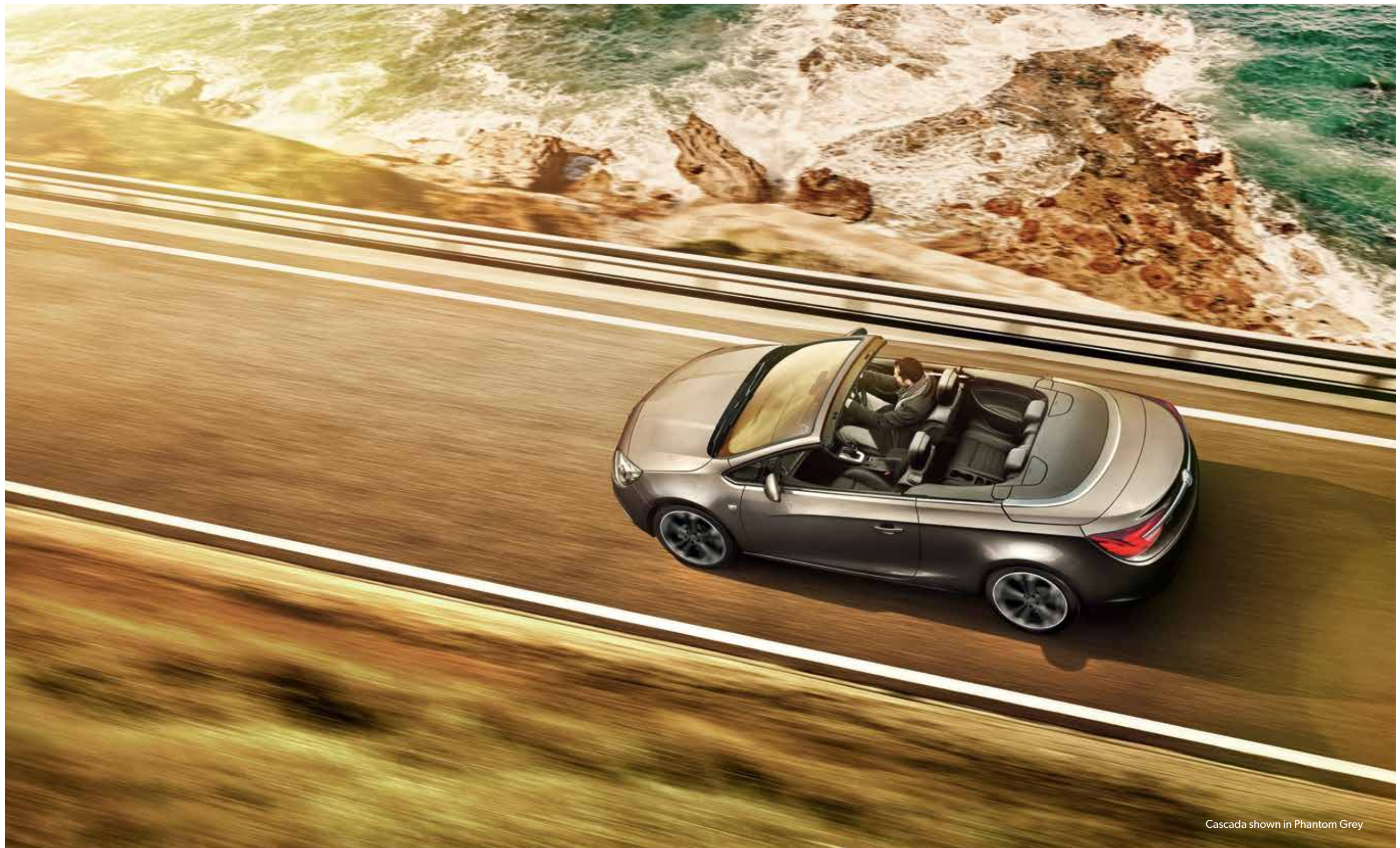
Cascada shown in Phantom Grey

Above: Savour the sensation while Sat Nav finds your final destination