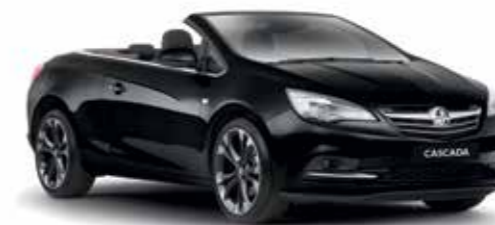
Carbon Flash Black