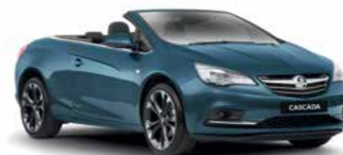
Deep Sky Blue

Variations between colours shown and actual paint colours/interior trim colours may occur due to the printing process. Certain colours may not be available from time to time.