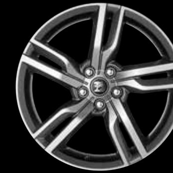
20" ALLOY WHEEL WITH MACHINED FACE AND MAGNETIC GREY ACCENTS