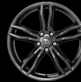
20" SV RAPIER FORGED ALLOY WHEEL IN DARK STAINLESS (OPTIONAL)