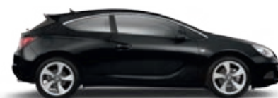
Carbon Flash Black*