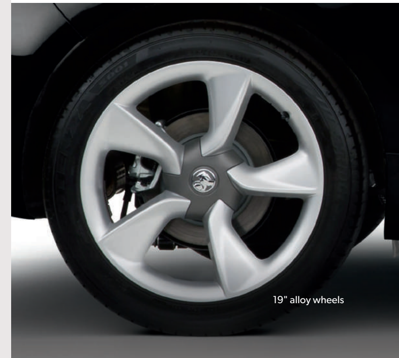
19" alloy wheels