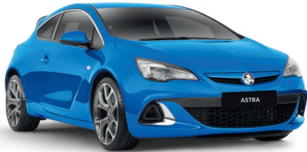
Astra VXR in Arden Blue