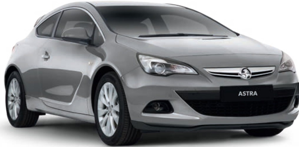
Astra GTC in Nitrate Silver with auto transmission shown