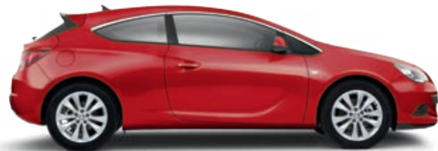
Astra GTC in Power Red with auto transmission shown