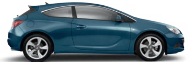
GTC Sport in Deep Sky Blue with manual transmission shown

The GTC Sport takes the excitement level up another notch. With extra flourishes such as 19-inch alloys, leather appointed trim, heated front sports seats and alloy sports pedals, it more than lives up to its name.