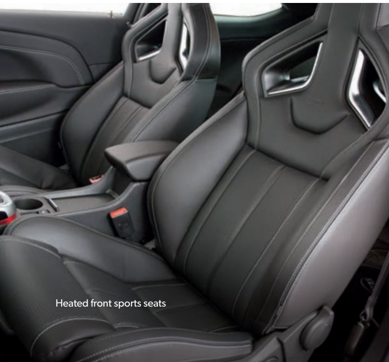
Heated front sports seats

Be prepared to be totally blown away. The absolute pinnacle of high performance engineering in the compact 3-door class, this is Holden's finest and hottest hatch ever.