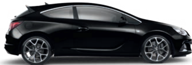
Astra VXR in Carbon Flash Black