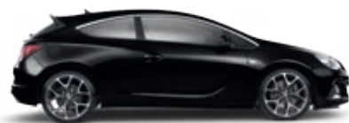
Carbon Flash Black*