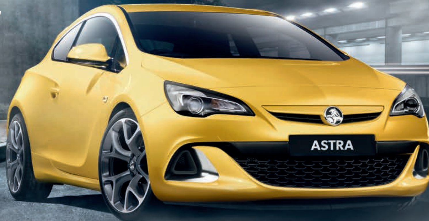
Astra VXR in Sunny Melon

Red-hot from Europe, the new Holden Astra has the go to match the show.