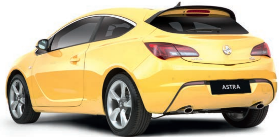
GTC Sport in Sunny Melon with manual transmission shown