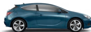
Deep Sky Blue*