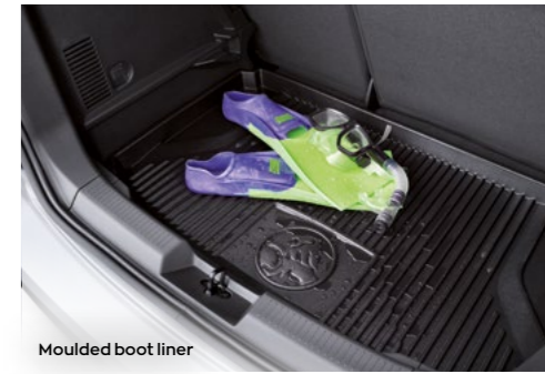
Moulded boot liner