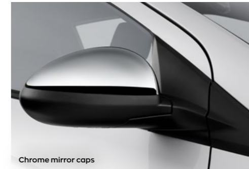
Chrome mirror caps