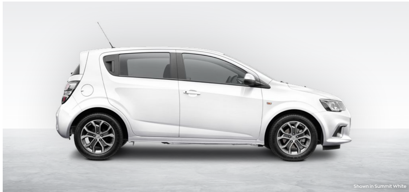
Shown in Summit White