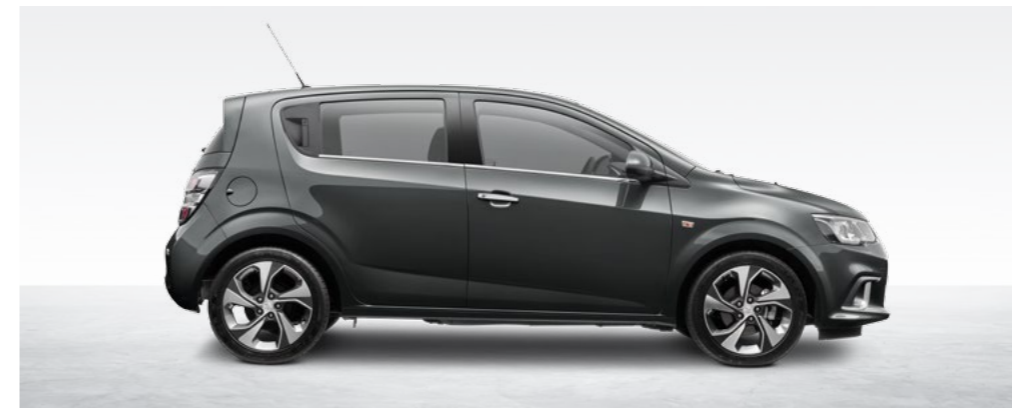
Son of a Gun Grey*