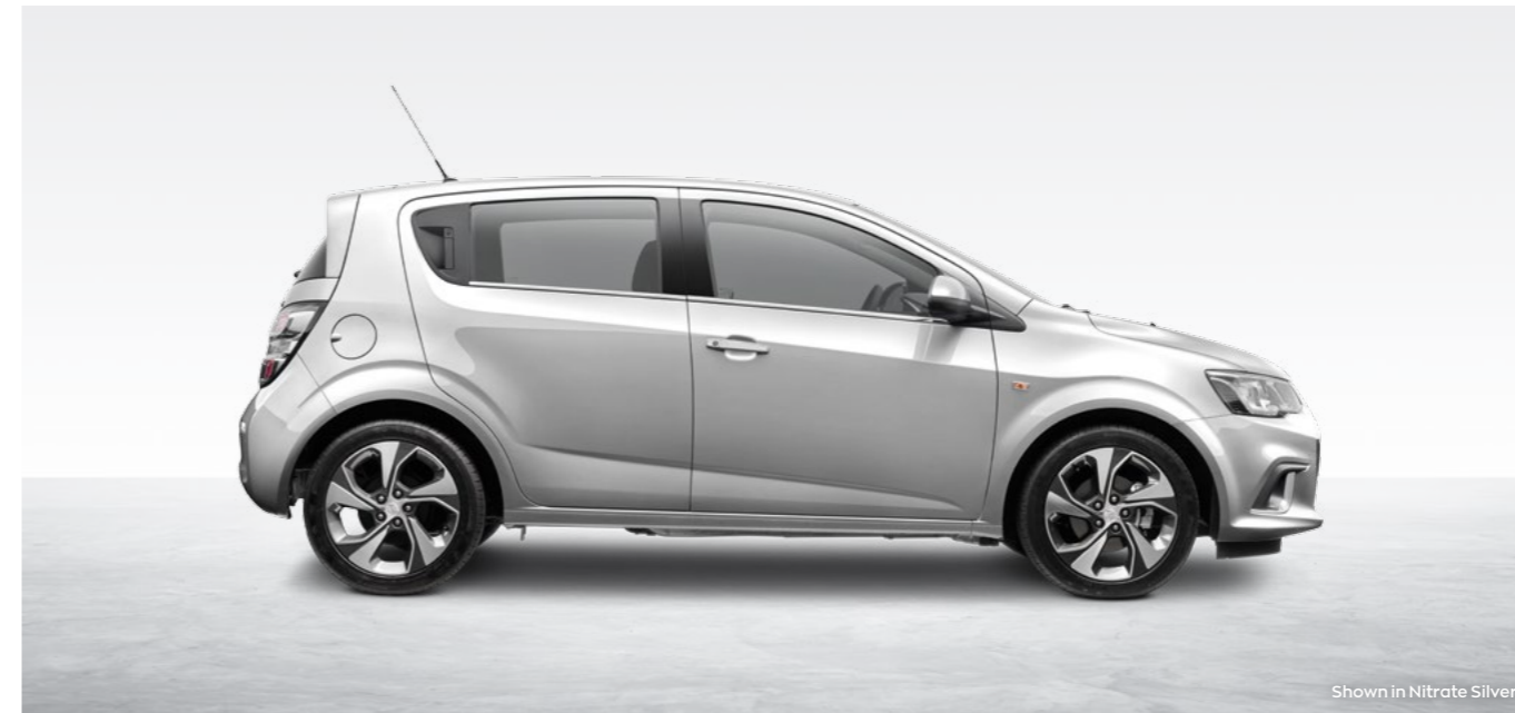
Shown in Nitrate Silver