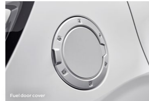
Fuel door cover