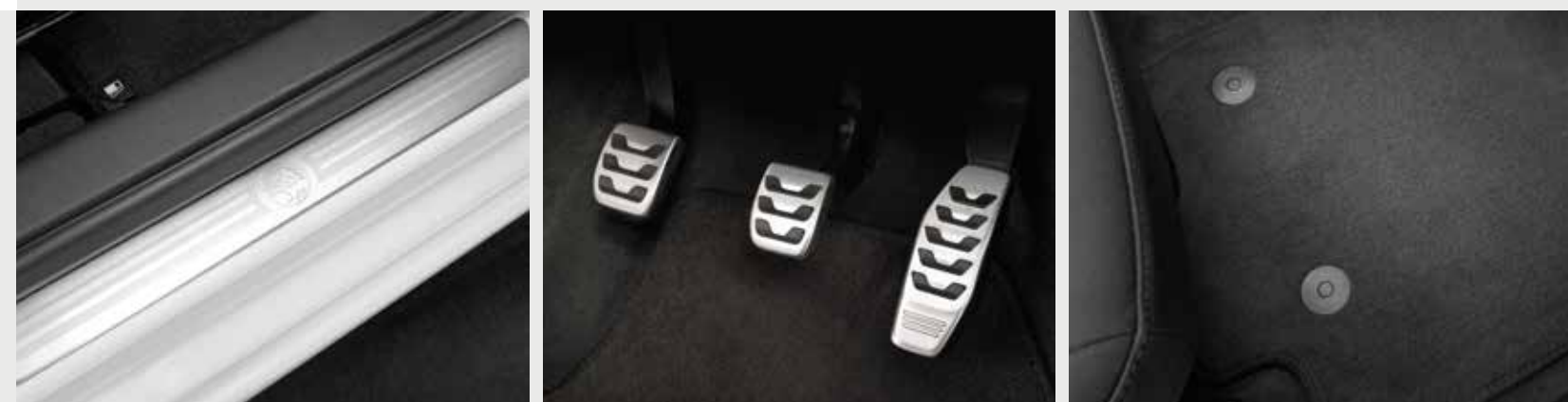
Sill Plates Sport Pedals Floor Mats