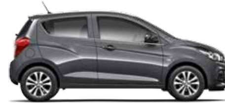
Son of a Gun Grey*