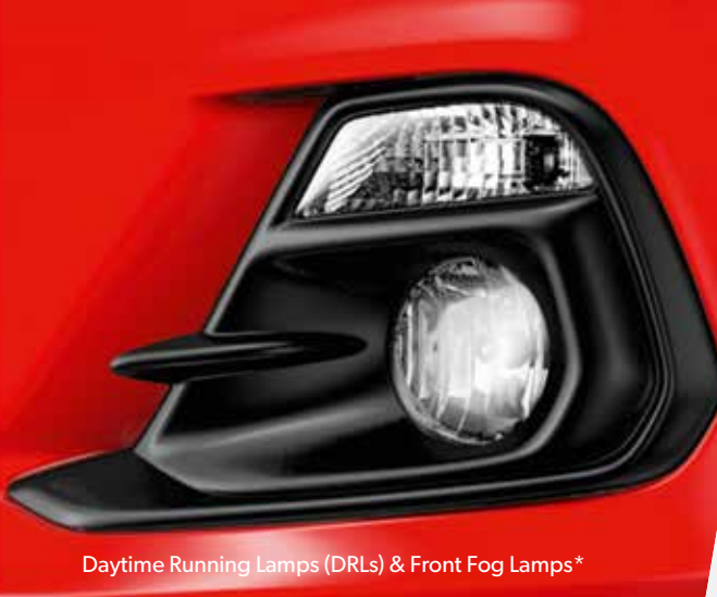
Daytime Running Lamps (DRLs) & Front Fog Lamps*