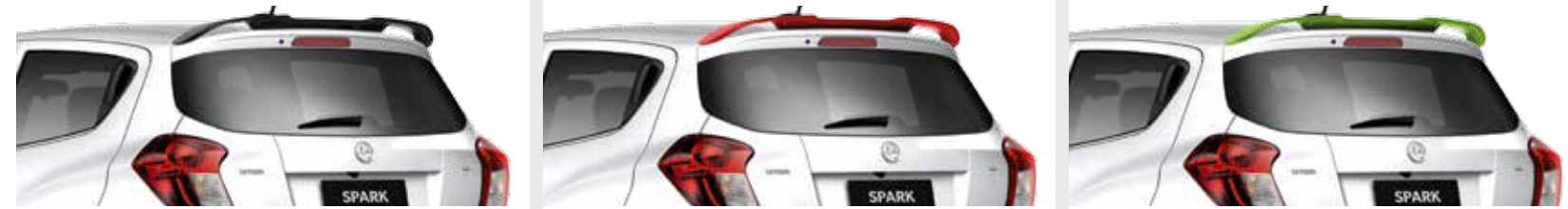
Spoiler, Black Spoiler, Solar Red Spoiler, Lime Green