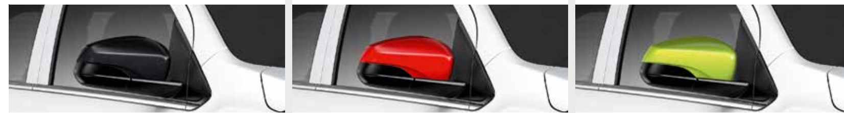
Mirror caps, Black Mirror caps, Solar Red Mirror caps, Lime Green