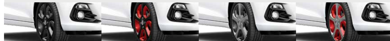
16" Wheels: Black with Satin Steel Grey insert Black with Solar Red insert Silver with Satin Steel Grey insert Silver with Solar Red insert