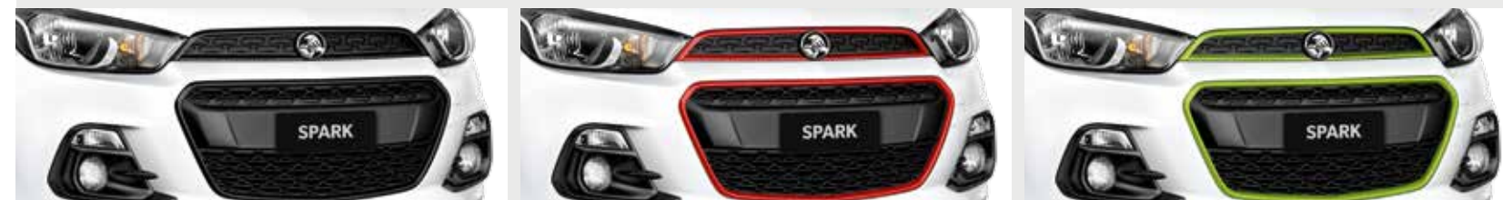
Grille, Black Grille, Solar Red Grille, Lime Green