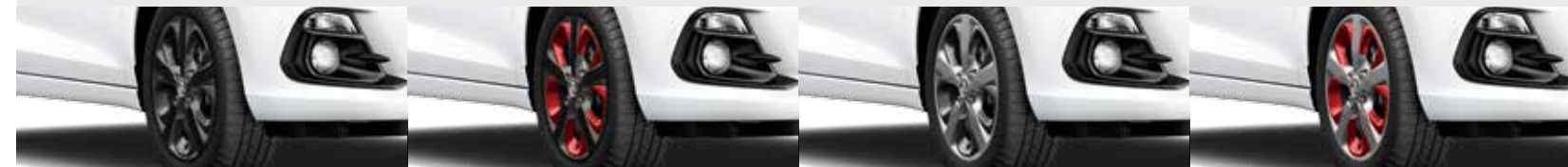
15" Wheels: Black with Satin Steel Grey insert Black with Solar Red insert Silver with Satin Steel Grey insert Silver with Solar Red insert