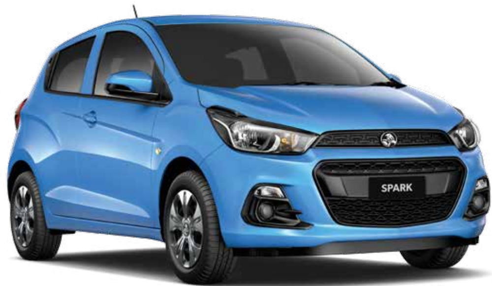
Spark LS in Splash Blue