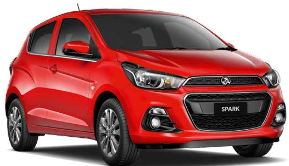
Spark LT in Absolute Red