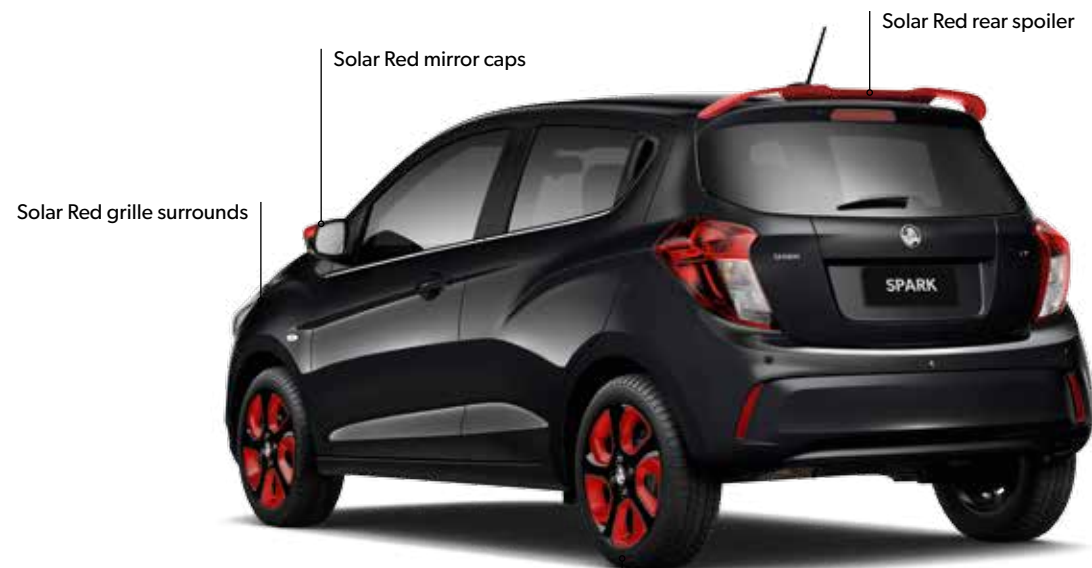
Spark LT in Mineral Black with Red Design Pack