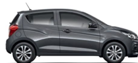
Son of a Gun Grey