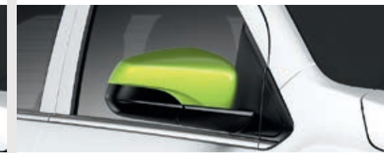
Mirror caps, Lime Green