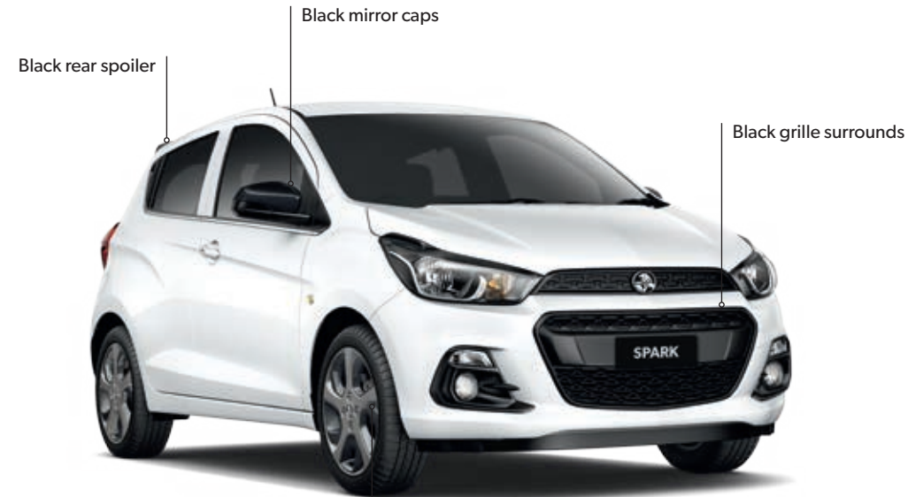
Black rear spoiler