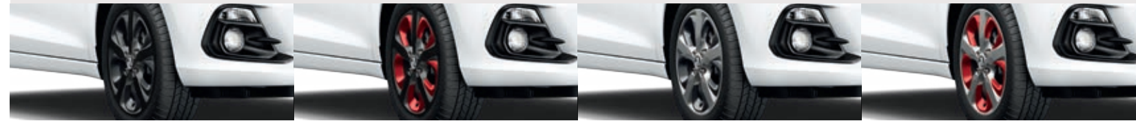
15" Wheels: Black with Satin Steel Grey insert