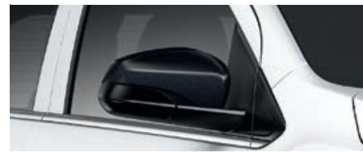
Mirror caps, Black