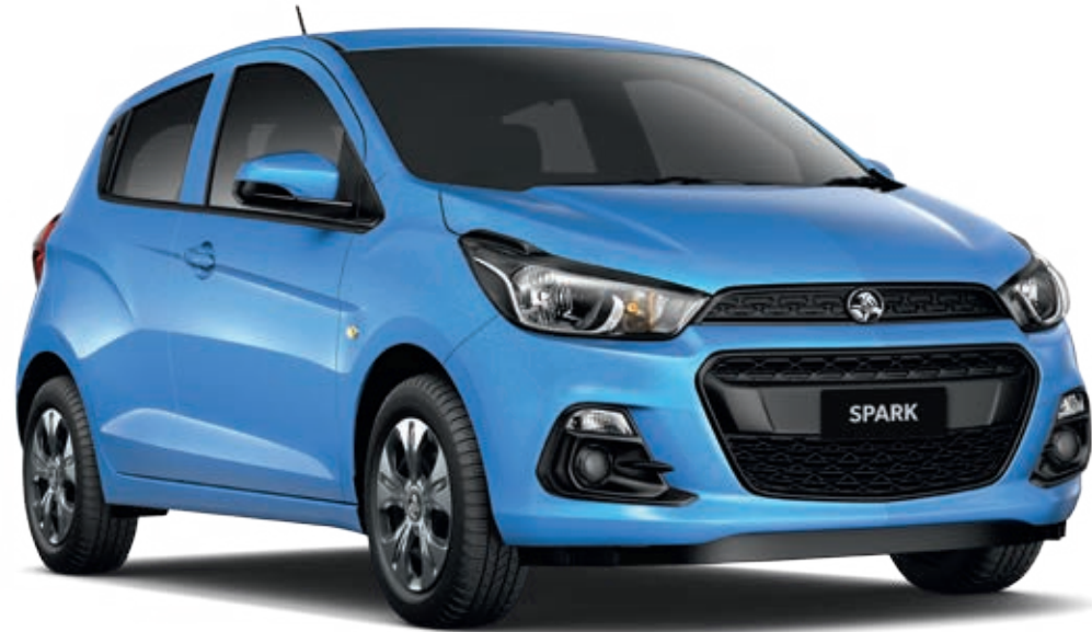
Spark LS in Splash Blue