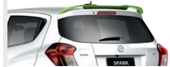
Spoiler, Lime Green