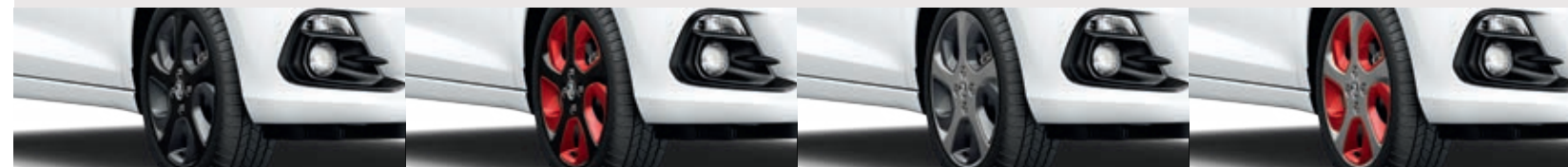
16" Wheels: Black with Satin Steel Grey insert