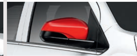
Mirror caps, Solar Red