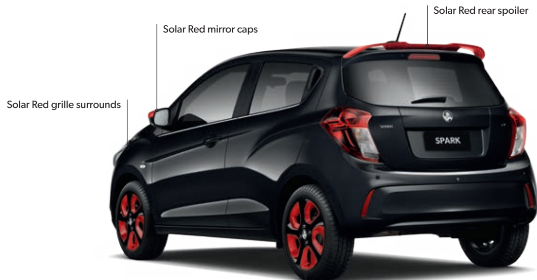
Solar Red mirror caps