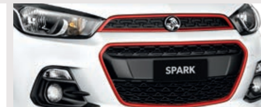
Grille, Solar Red