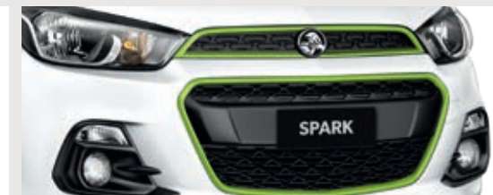
Grille, Lime Green