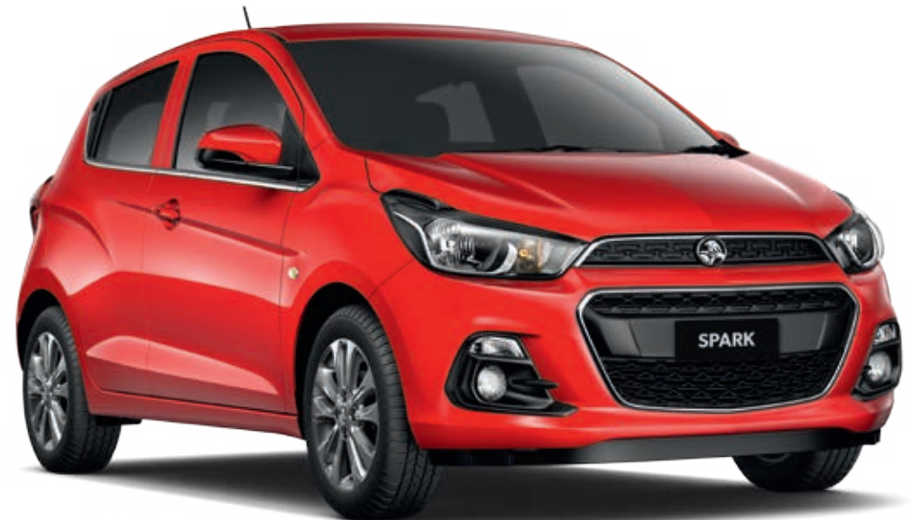
Spark LT in Absolute Red