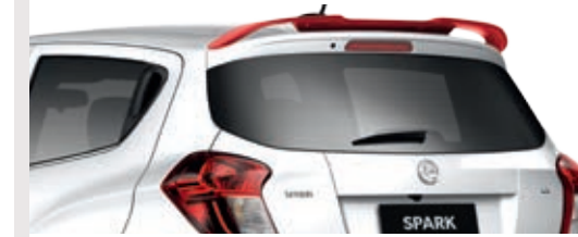
Spoiler, Solar Red